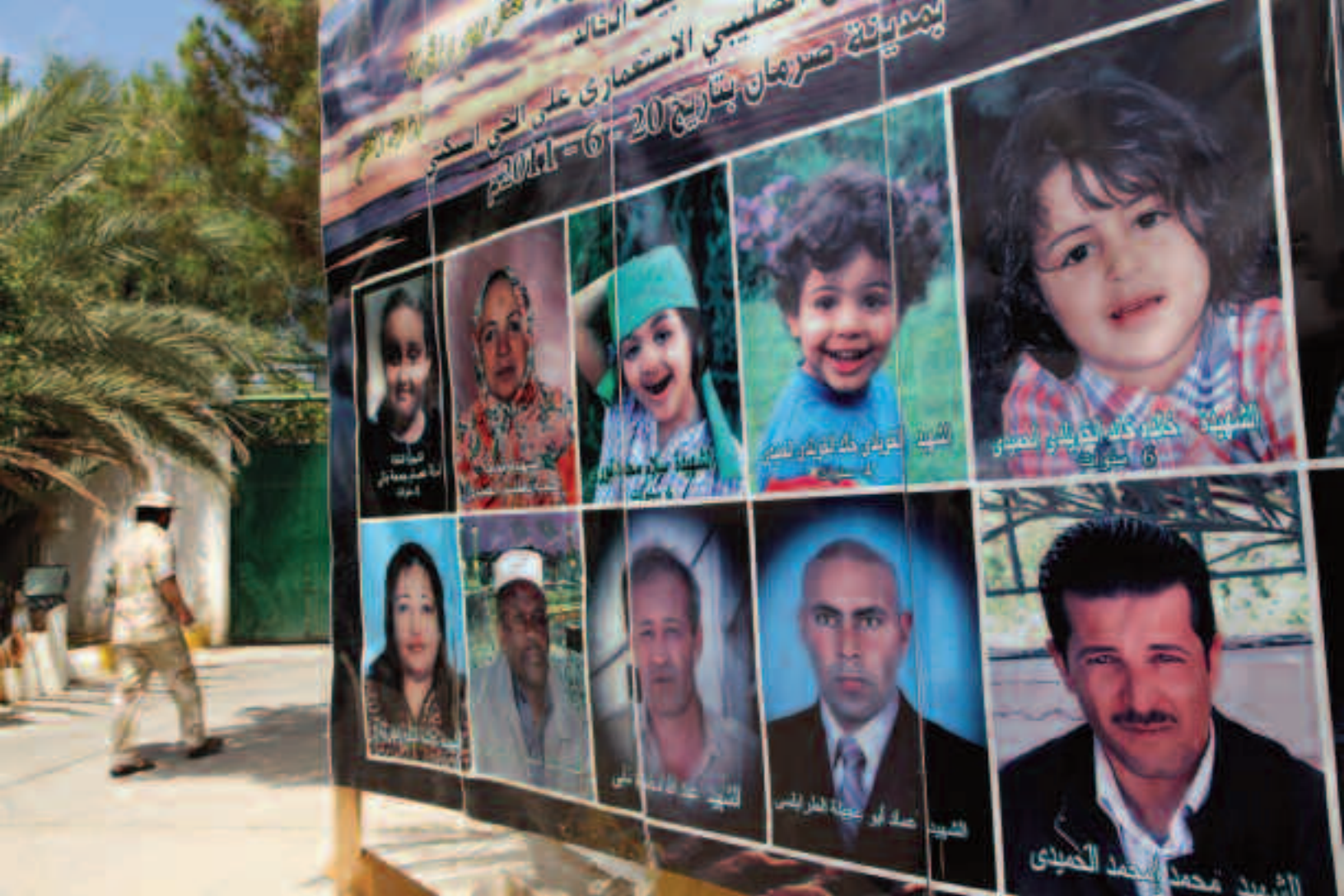
Posters of victims of NATO air strikes seen on June 20, 2011 outside the large el-Hamedi family farm in Sorman. A guard walks in the background.