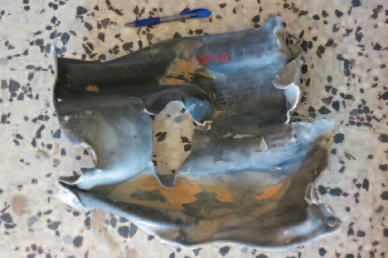
A tail fin from a 500 pound laser-guided bomb (GBU-12) found in Majer, where NATO air strikes killed 34 civilians and wounded more than 30 on August 8, 2011.