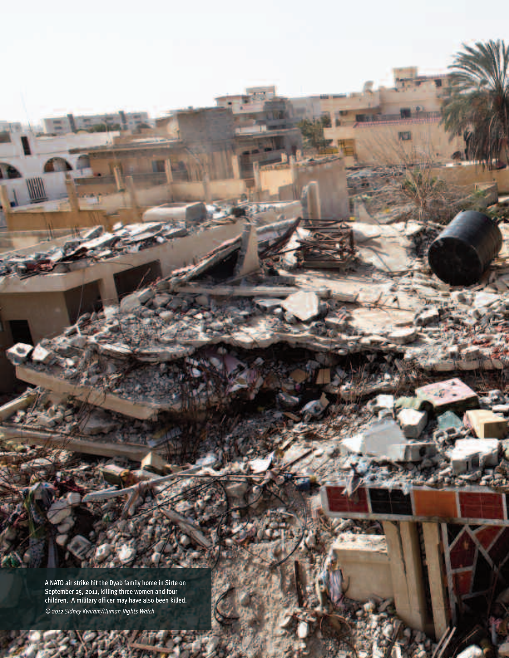
A NATO air strike hit the Dyab family home in Sirte on September 25, 2011, killing three women and four children. A military officer may have also been killed.