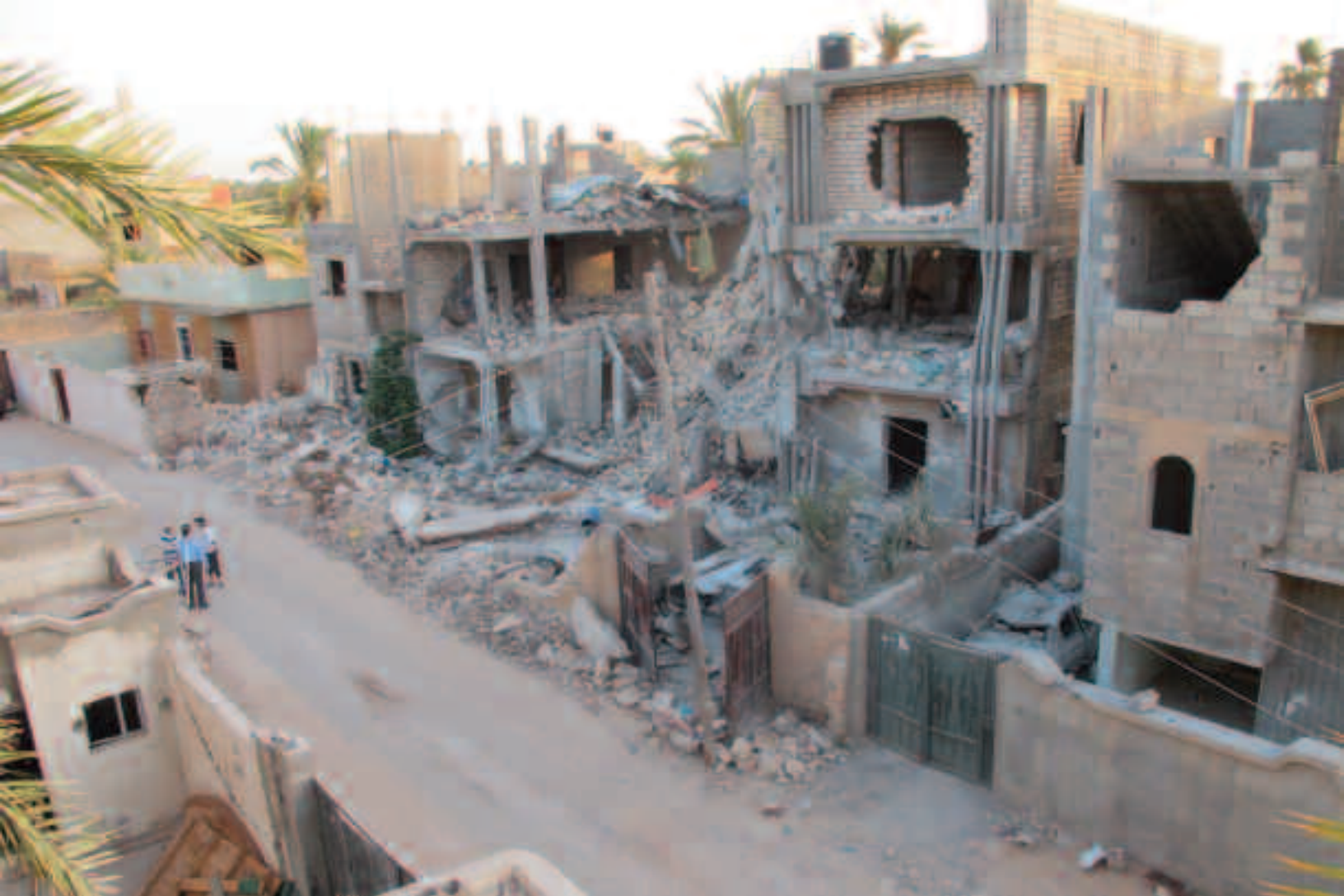
(above) A NATO air strike on the al-Gherari house in Tripoli on June 19, 2011 killed five members of the family. NATO said the strike was due to a “weapons system failure.”