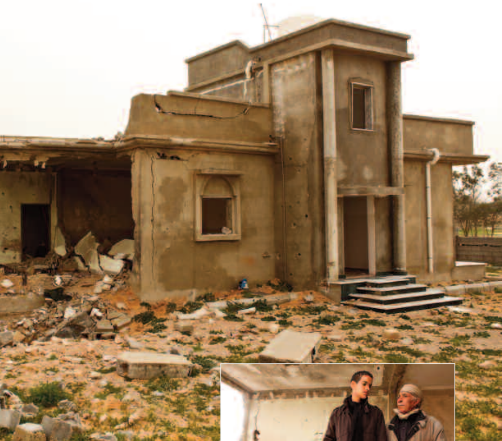
(above) A NATO air strike hit the Gidwar family home in al-Gurdabiya, east of Sirte, on September 23, 2011, killing an elderly man and two girls aged 8 and 10.