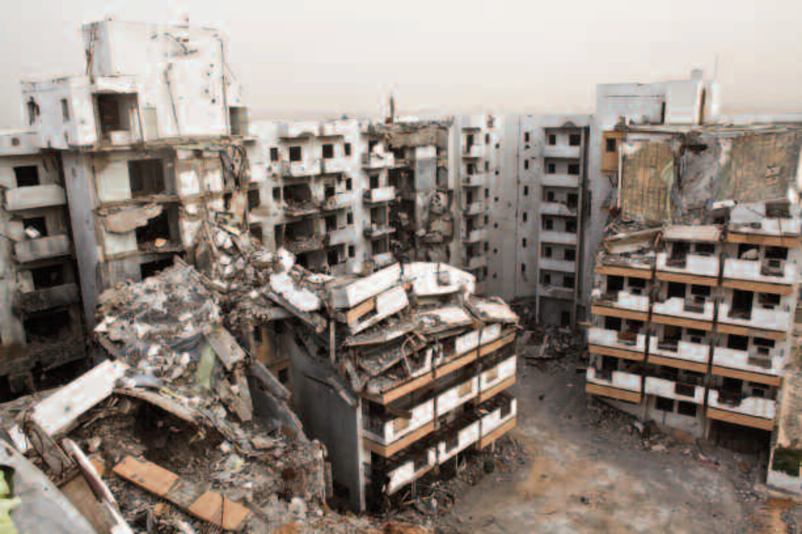
NATO air strikes struck the Imarat al-Tameen apartment complex in downtown Sirte multiple times on September 16, 2011, killing one man and one pregnant woman.