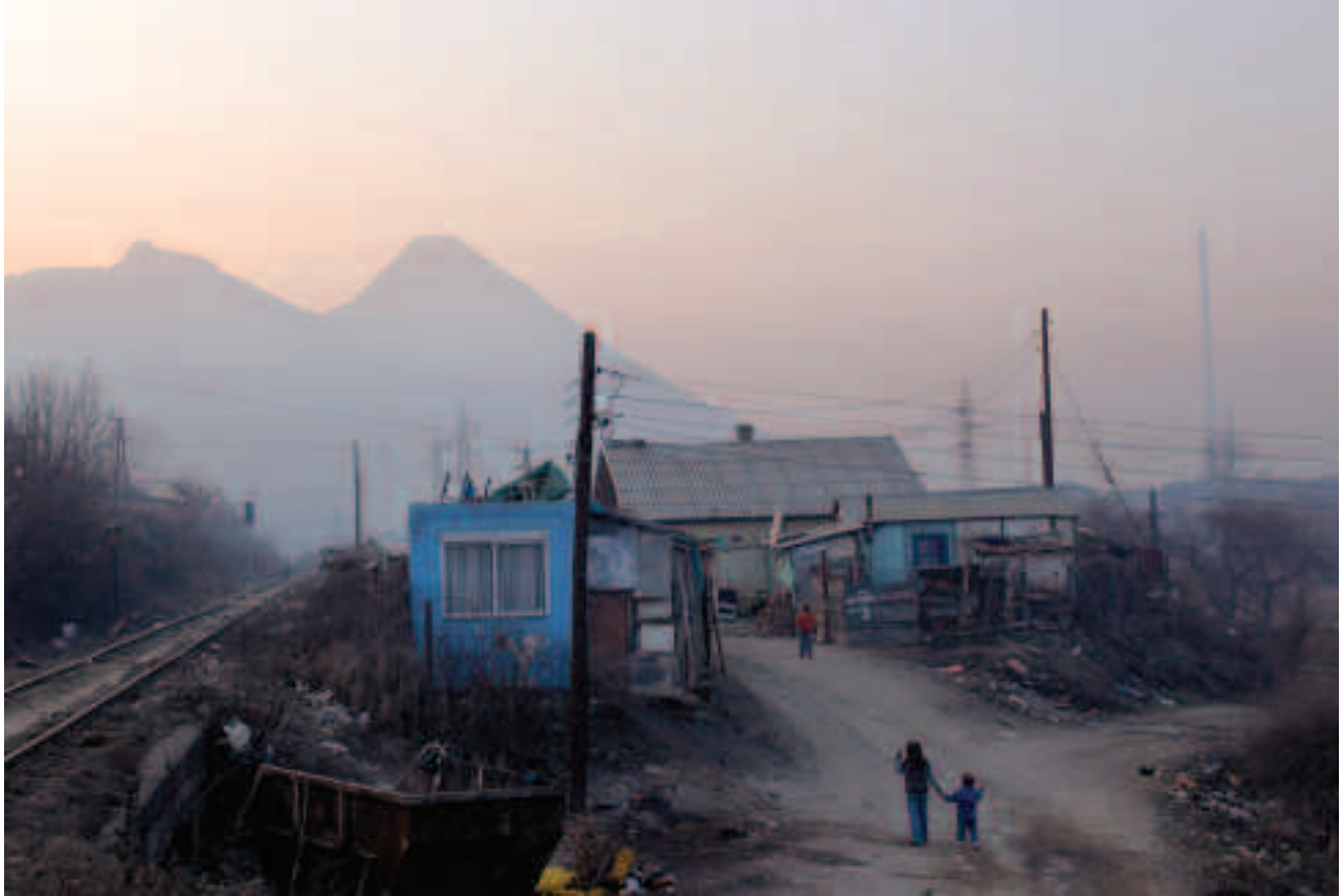
The Cesmin Lug camp in northern Mitrovica has the worst living conditions among the current camps as well as very high levels of lead contamination.