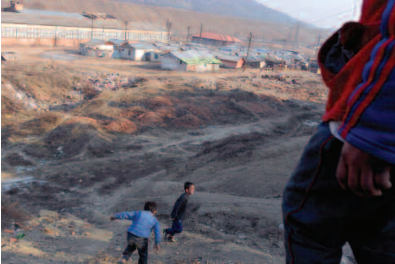
Roma IDP children play on lead contaminated land near the Zitkovac camp in Zvečan. The camp was closed in 2006 and its inhabitants voluntarily relocated to Osterode camp.