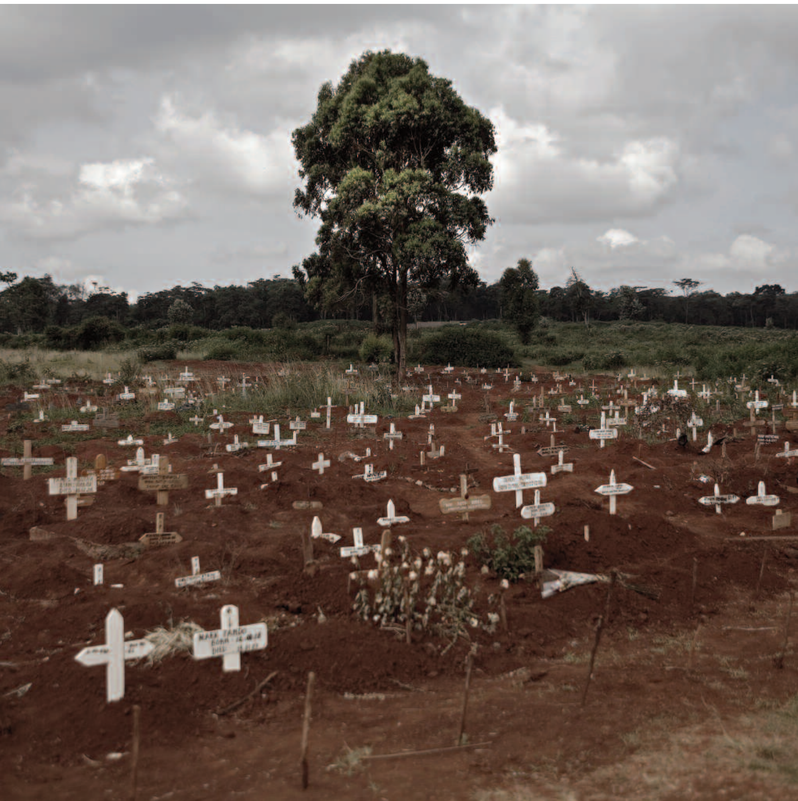
A Kenyan cemetery. Some 40,000 children in Kenya are likely to die if they do not receive antiretroviral treatment.