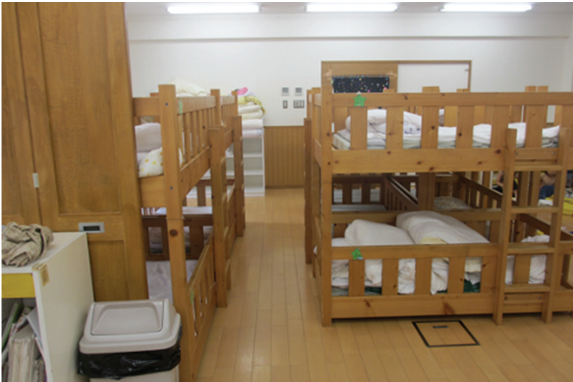
Beds for children in kindergarten at a child care institution in the Kansai region. The beds are supplemented by a small playing space in the same room, June 2012.