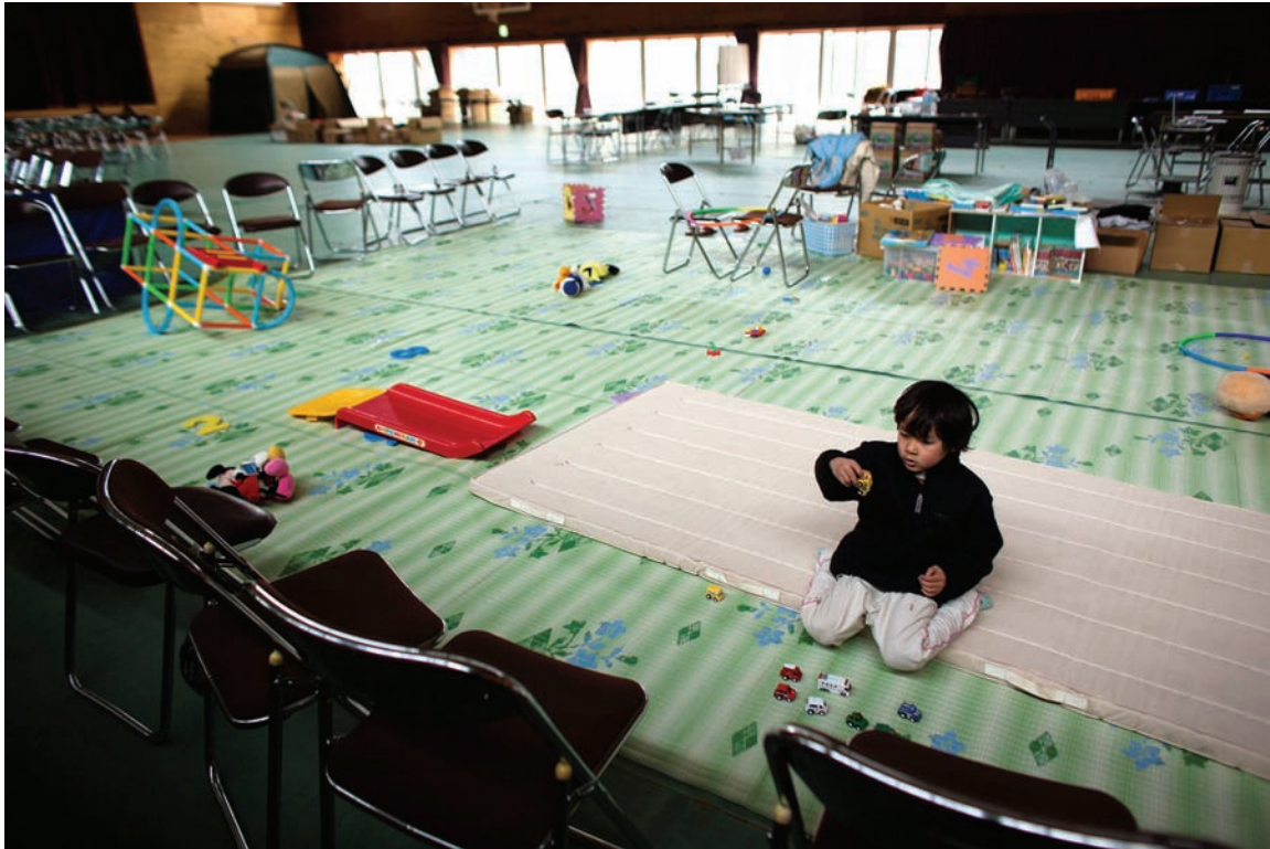
A child plays inside an evacuation center in Kamaishi in Iwate prefecture, March 2011.