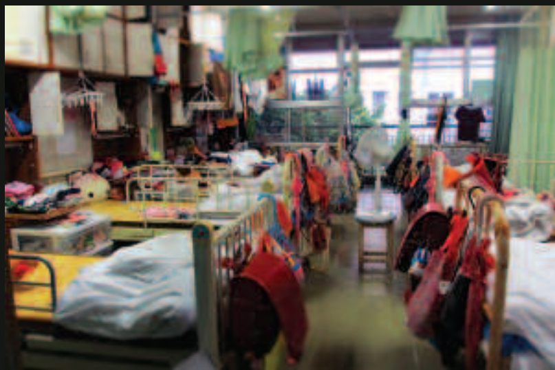
Beds in sleeping quarters for elementary school girls at a child care institution in Iwate prefecture. Eight girls share a room, and the space on their own bed is the only place children are allowed some privacy. Even such privacy is guaranteed only by a simple curtain surrounding each bed, August 2012.

Human Rights Watch recommends that Japan undertake urgent reforms to transition its alternative care system away from reliance on institutions toward greater use of foster care and adoption where children can live in family-like settings. Japan should also reform its Child Welfare Act to support more child rights-friendly processes and ensure adequate resources and political commitment to support children in alternative care.