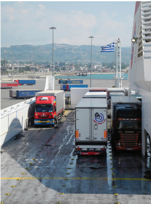
Trucks of the sort migrants stow away on hoping to reach Italy, loading onto ships at the Patras port. Migrants stow away between the axles, inside fuel tanks, or inside refrigerated containers.

coming with risk of loss of limbs or death, while hanging underneath a commercial truck or hiding inside refrigerated containers or fuel tanks.