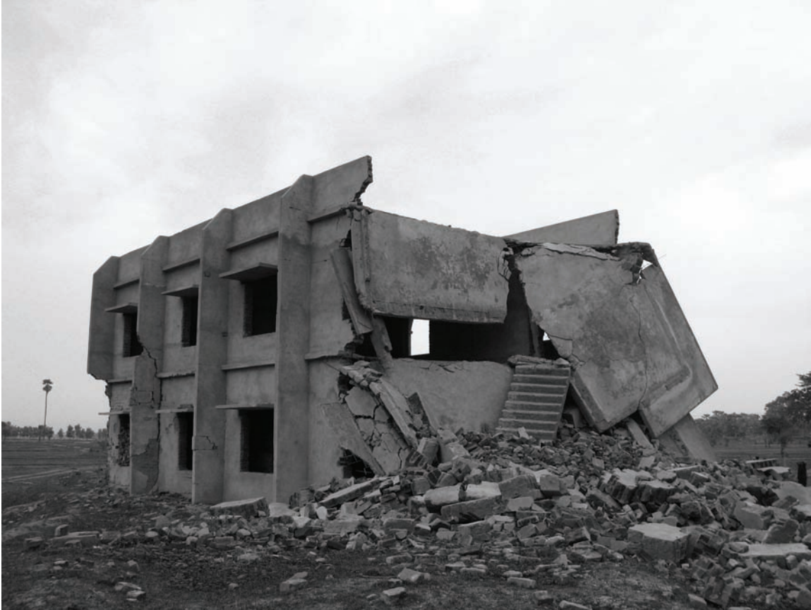
Figure 1: The damage caused to the new school building at Gosain-Pesra by a series of explosions set by Naxalite fighters on April 14, 2009.

In an anonymous article in CPI (Maoist) Information Bulletin in November 2008, in reaction to the Human Rights Watch report, “Being Neutral is Our Biggest Crime: Government, Vigilante, and Naxalite Abuses in India’s Chhattisgarh State,” 103 the author defended the Naxalites’ attacks on schools: