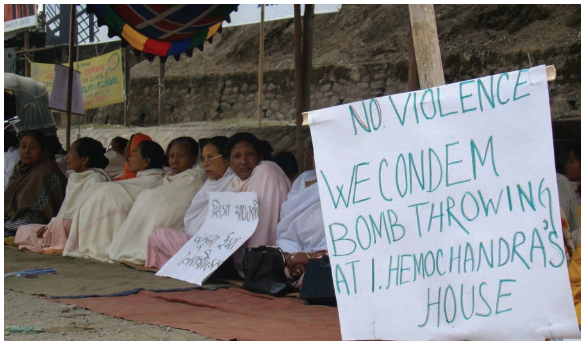
Protest against attack by militants in Imphal, the capital of Manipur.

Manipuris complain most about militant groups' culture of extortion. The state is unable to provide protection from these extortion demands—in fact, many government officials pay themselves. Recently, there has been a spate of abductions by militant groups to recruit children into armed groups involved in fighting. At least 24 school children were reported missing in June and July 2008, leading to widespread protests. One faction of the militant group People's Revolutionary Party of Kangleipak (PREPAK) admitted that that they had recruited some of the missing children.