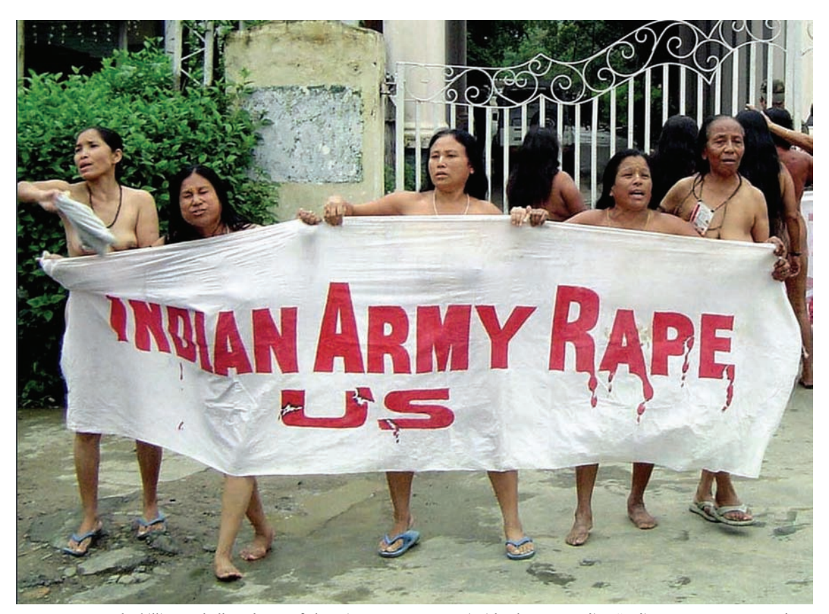
Women protest the killing and alleged rape of Thangjam Manorama Devi with a banner reading "Indian Army Rape Us" at the army headquarters in Imphal in July 2004.

Indian Prime Minister Manmohan Singh meanwhile promised justice in the Manorama case and a review of the AFSPA. In November 2004, he set up a committee headed by B.P. Jeevan Reddy, a retired judge of the Supreme Court. The report was submitted in June 2005. While the Jeevan Reddy committee report has also not been made public, the contents were leaked, and it is now known that the committee recommended repeal of the AFSPA. The report however remains with the cabinet in New Delhi for consideration, and no action has been taken.