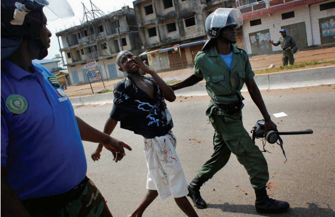
Guinean police detain a supporter of UFDG presidential candidate Cellou Dalein Diallo during a an episode of election-related violence in Conakry, Guinea, Monday November 15, 2010.

Human Rights Watch urges the new government to ensure independence from the presidency in making the commission operational, including in appointments and financing, in compliance with the Paris Principles and best practices of human rights commissions. The creation of a strong, independent, and sufficiently-financed and impartial body can play a meaningful role in helping develop a culture of respect for human rights and the rule of law in Guinea.