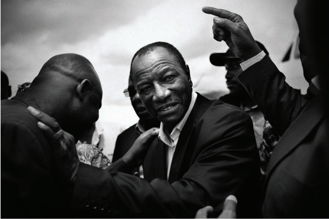
To sustain the momentum generated by the elections and fulfill the expectations of Guineans, Guinea's new president, Alpha Condé, must take decisive steps to address the profound human rights and governance problems he has inherited.

After the medical evacuation of Dadis Camara from Guinea, the more moderate General Sékouba Konaté, then-Vice President and Minister of Defense, assumed power and began to bridge the increasingly volatile cleavages along ethnic, generational, and political lines within the army. Over the next 11 months, Guinean actors—including General Konaté and other members of the military and civil society who were determined to freely and fairly elect their leaders—ushered in, with the support of the international community, the political process leading to the presidential election of November 2010.