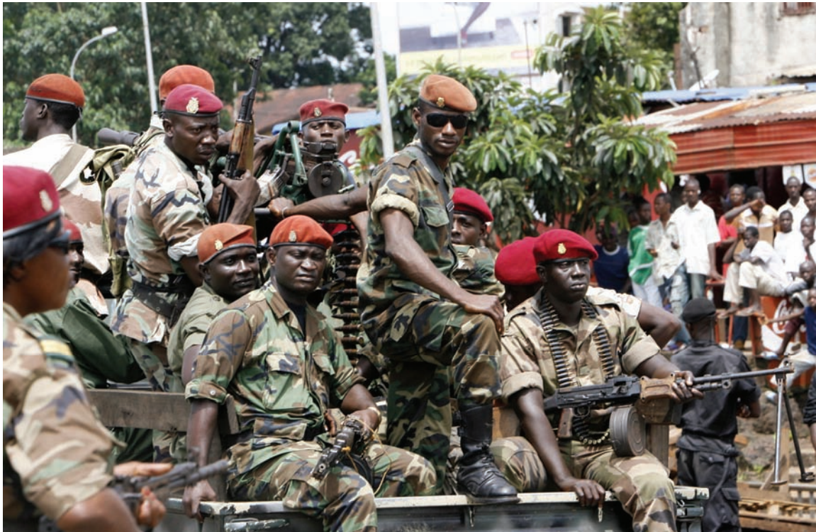
Soldiers patrol on a vehicle near the international airport in Conakry, October 05, 2009. (Guinea Military)

In 2009 ECOWAS, the UN, and the AU launched a security sector reform initiative envisioned to identify problems and recommend ways to address these problems. The effort is broadly aimed at subjecting the security services to civilian oversight, reducing the bloated numbers of the army, and ensuring fiscal transparency. Findings by the group were presented in a report to the Guinean transitional government in May 2010. The report's over 150 well-founded recommendations to professionalize the sector are meant to serve as the operational roadmap for reform.