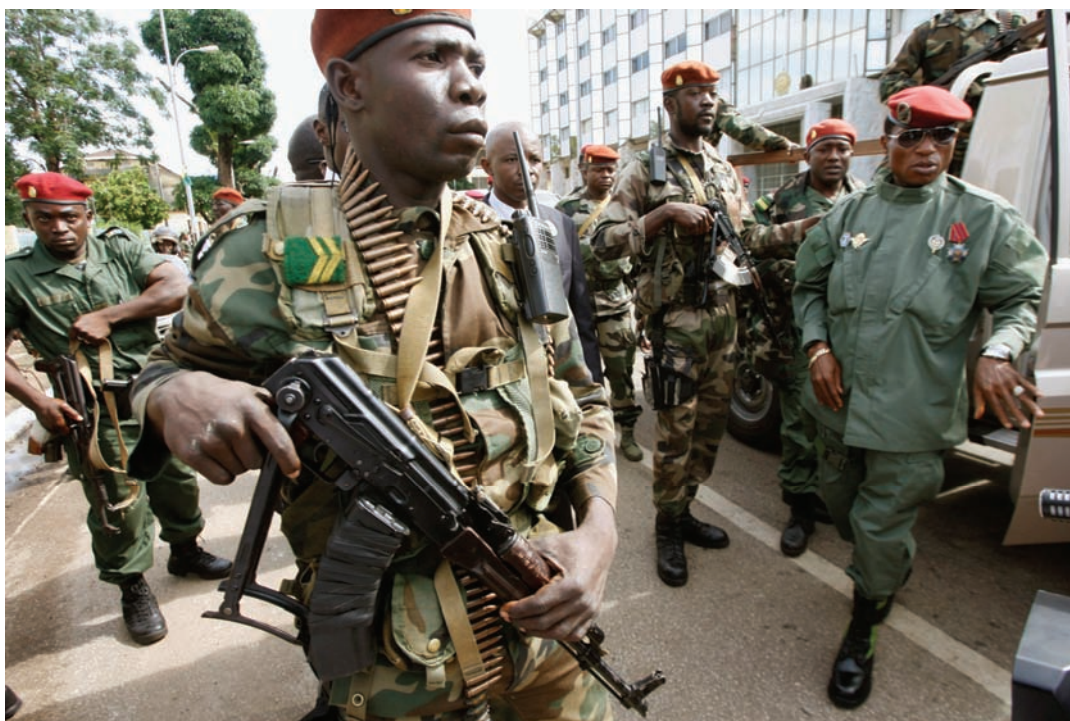
Captain Moussa Dadis Camara, then-chief of the ruling junta, arrives for celebrations commemorating the Republic of Guinea's independence day on October 2, 2009.

There is considerable disagreement among Guinean human rights defenders, victims, and others about whether the Guinean judiciary or the ICC should assume responsibility for investigating and trying those responsible for the September 2009 crimes. Guinea ratified the Rome Statute, the ICC's founding treaty, on July 14, 2003. As such, the ICC has jurisdiction over war crimes, crimes against humanity or genocide possibly committed in Guinea or by nationals of Guinea, including killings of civilians and sexual violence. 48 However, it is a court of last resort; under the principle of complementarity, it intervenes only when national jurisdictions are unwilling or unable to investigate or prosecute such crimes. 49