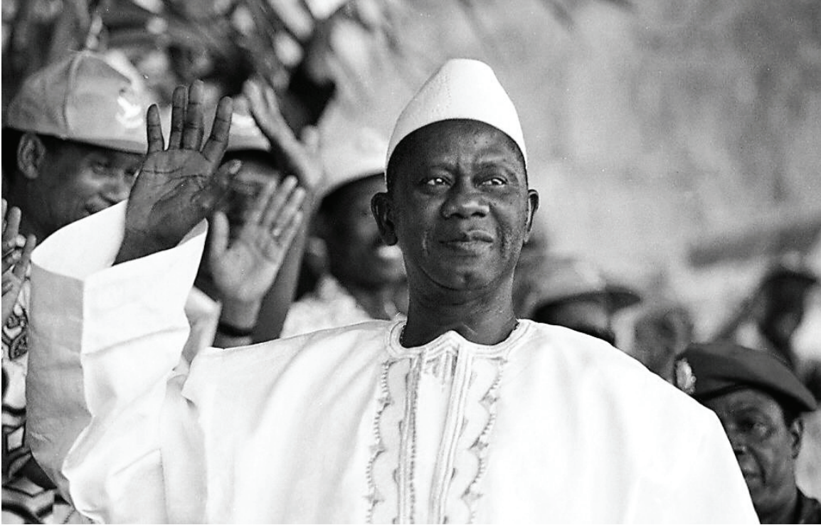
Army Colonel Lansana Conté took over in a coup d'état in 1984. Despite initial promises to ensure better respect for human rights, President Conté presided over another quarter century (1984-2008) of state-sponsored abuses and repression, albeit far less extreme than those of his predecessor.

Conté and his government also presided over an increasing criminalization of the state in which members of the ruling party, his family, and security forces engaged in frequent criminal acts ranging from theft and embezzlement to drug trafficking. 19 By the end of Conté's regime, Guinea had become a major transit hub in West Africa for narcotics being trafficked from South America to Europe. 20