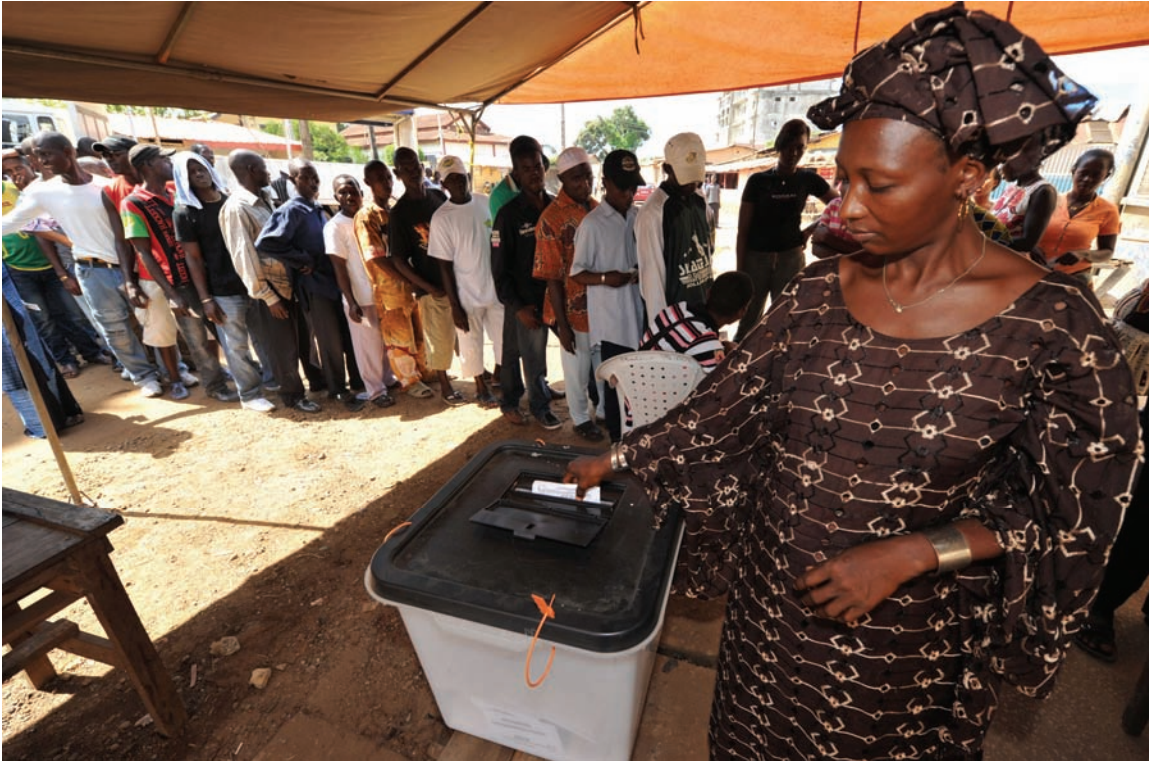
A woman casts her vote at a polling station in Conakry on November 7, 2010.

Corruption within both the public and private sectors in Guinea has long been endemic. From the petty corruption and bribe-solicitation perpetrated by frontline civil servants to the extortion, embezzlement and illicit contract negotiations that take place in the shadows, those involved in bribery and various forms of corruption are rarely investigated, much less held accountable. Guinea's past rulers have also largely mismanaged, embezzled, and squandered the proceeds from the country's abundant natural resources, thereby denying the majority of the population access to even the most basic health care and education. As a result, Guinea is one of the world's poorest countries and suffers some of the world's highest rates of infant and maternal mortality and adult illiteracy, despite its natural resources.