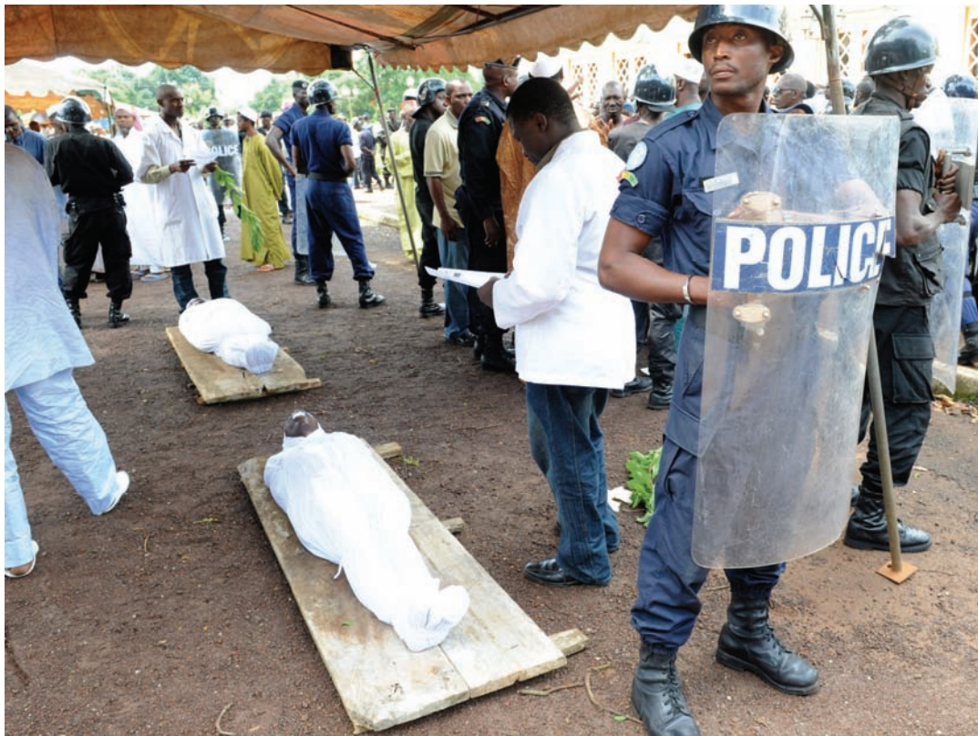
A policeman stands next to the bodies of people shot dead by Guinea junta forces on September 28, 2009 in front of the Conakry great mosque.

On April 1, 2011, following a visit to Guinea, Bâ Amady, head of international cooperation in the ICC's Office of the Prosecutor, issued a declaration recognizing the cooperation of the Guinean authorities and the new government's commitment to bringing perpetrators to justice. However, he urged the government to increase accountability efforts and reiterated the ICC's responsibility to take action if the government fails to do so promptly and adequately. 47