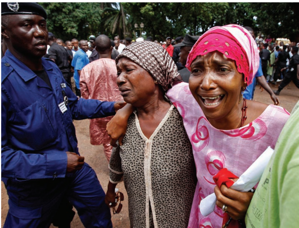
Women at Conakry's great mosque react as they look for the bodies of family members and friends that were killed during a rally on September 28, 2009.

At the time of writing there has been scant information regarding progress on the investigation and no evidence of government efforts to locate the over 100 bodies believed to have been disposed of secretly by the security forces. Unfortunately, the military hierarchy failed to put on administrative leave, pending investigation, soldiers and officers known to have taken part in the September 2009 violence. Human Rights Watch is also concerned about President Condé's appointment of two individuals implicated in the September 2009 violence into government positions: Lt. Colonel Claude Pivi who is the Minister of Presidential Security ( Ministre chargé de la sécurité présidentielle ) and Lt. Colonel Moussa Tiégboro Camara who serves as Director of the National Agency against Drugs, Organized Crime, and Terrorism ( Directeur de l'Agence nationale à la présidence chargé de la lutte contre la drogue, les crimes organisés et le terrorisme ). 42