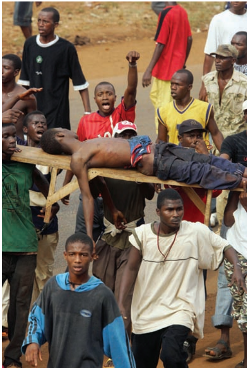
Protesters carry the body of a demonstrator who was killed by security forces during a demonstration on January 22, 2007 in which tens of thousands of Guineans in the capital city of Conakry attempted to march to the National Assembly building. The individual pictured here was one of at least 129 killed by security forces during the January and February, 2007 strike violence.

“command responsibility” enables military commanders and others in positions of authority to be held criminally liable when crimes are committed by forces under their effective command and control, when they should have known about the crimes, and when they fail either to prevent the crimes or prosecute those responsible. Guinea’s current penal codes are not adequately developed with respect to these international and human rights law concepts, presenting an additional judicial challenge for September 2009 accountability trials.