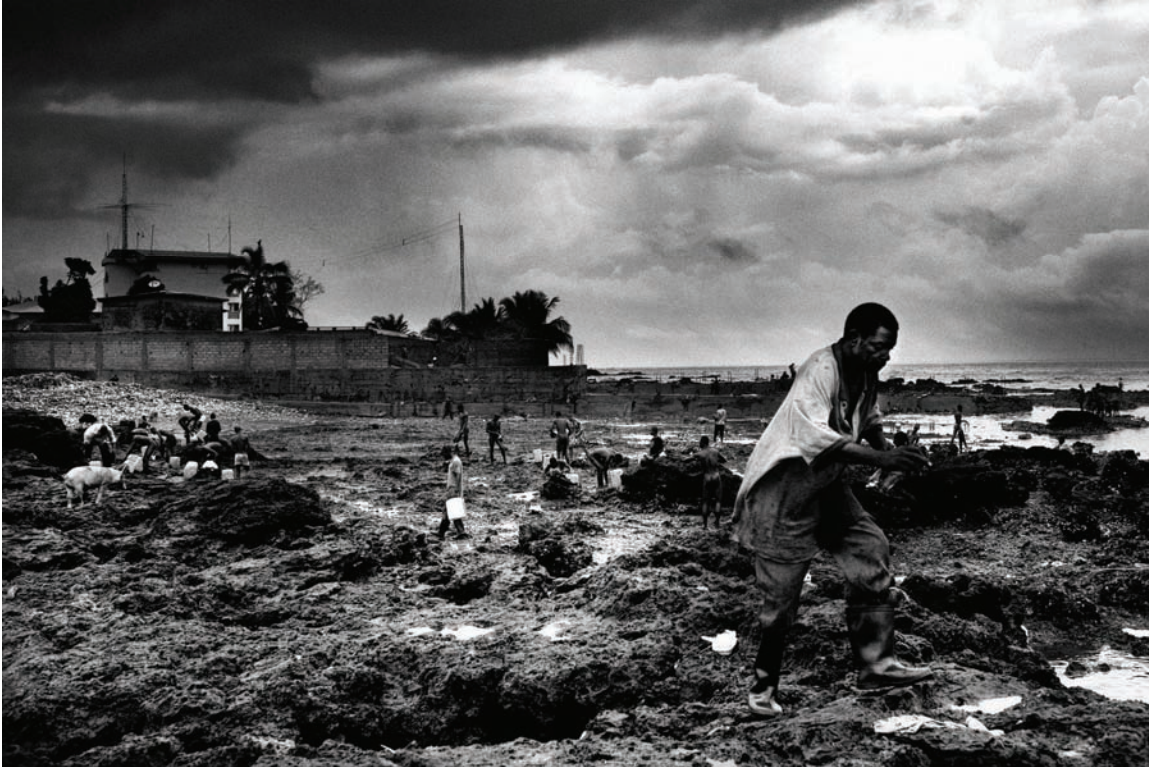
Pigs look for food in a garbage dump behind an abattoir while men wash themselves in the sea. Guinea ranked 156th out of 169 countries on the United Nations Human Development Index in 2010. Conakry, Guinea.

In large part as a result of pressure applied by the diplomatic community and international financial institutions, by 2009 Guinea had established many protocols, procedures, and laws to improve its economic governance. In terms of international protocols, Guinea has signed but not ratified the African Union Convention on Preventing and Combating Corruption and the United Nations Convention against Corruption.