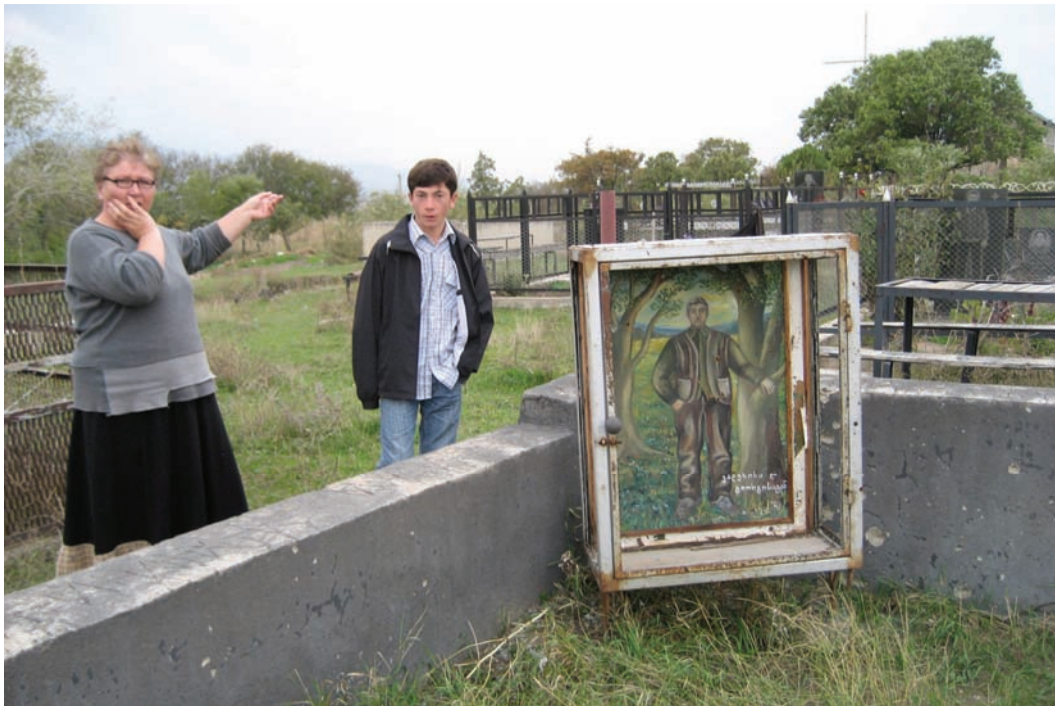
A woman injured during a Russian cluster munition strike on Ruisi on August 12, 2008, points toward the tree where she and three other women, also injured, had sought shelter. The gravestones of the adjacent church cemetery, pictured here on October 15, 2008, had holes from 9N210 fragmentation. The boy in the photograph came to report a nearby submunition dud.