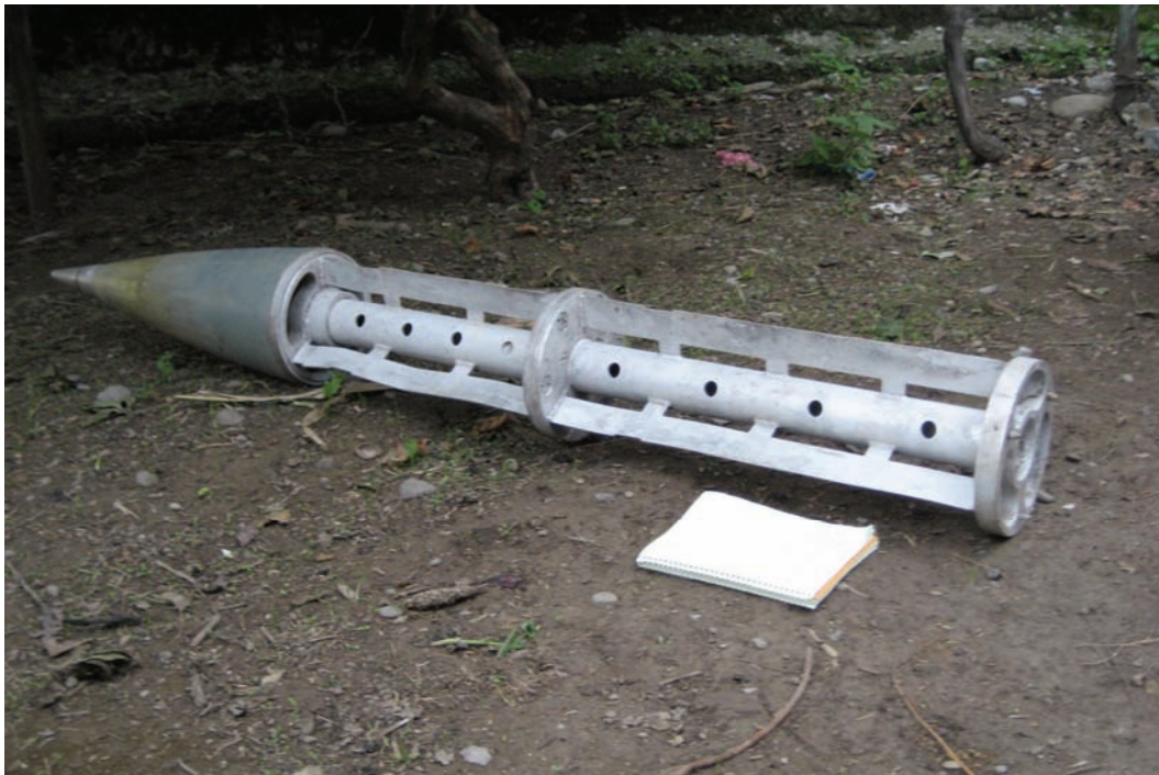
A local farmer found this Uragan (Russian for Hurricane) rocket near where four women were injured by a Russian cluster munition strike on Ruisi on August 12, 2008. The ground-launched rocket, shown here on October 15, 2008, carried 30 9N210 submunitions.