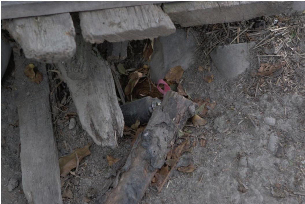
An unexploded M85, an antipersonnel and anti-armor submunition, lies next to a building in Shindisi in August 2008. Bought from Israel and launched by Georgia, this submunition is carried in a Mk.-4 160mm rocket.