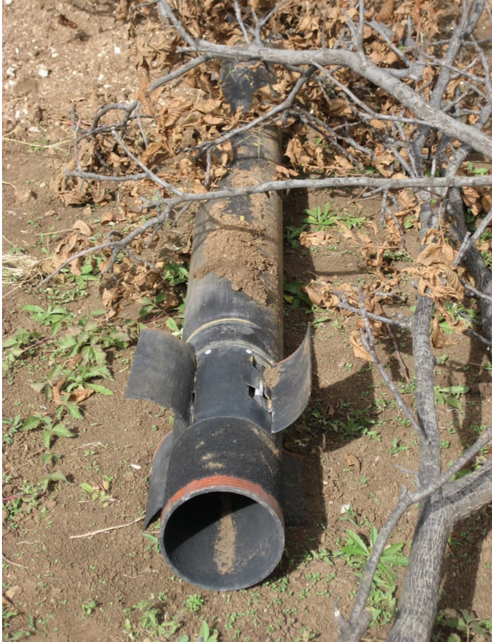
A Mk-4 160mm rocket lies in a field in Ditsi on October 17, 2008. Bought from Israel and launched by Georgia, the rocket carries 104 M85 submunitions.