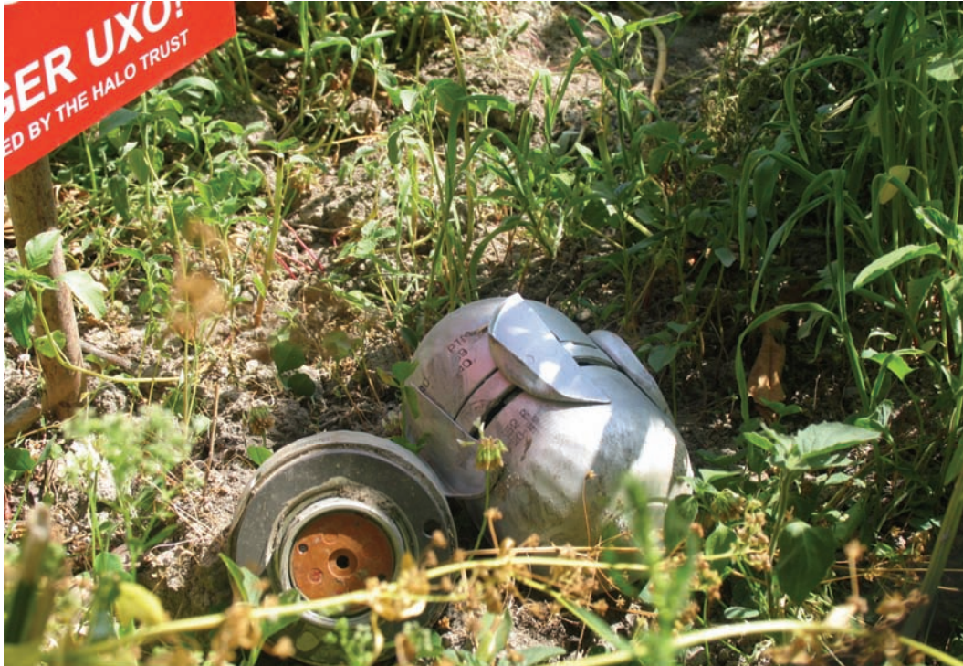
An unexploded Russian AO-2.5 RTM submunition lies near the public square in the center of Variani in August 2008. The submunition, an antipersonnel and anti-materiel weapon, can be carried in RBK-500 and RBK-250 air-dropped cluster munitions.