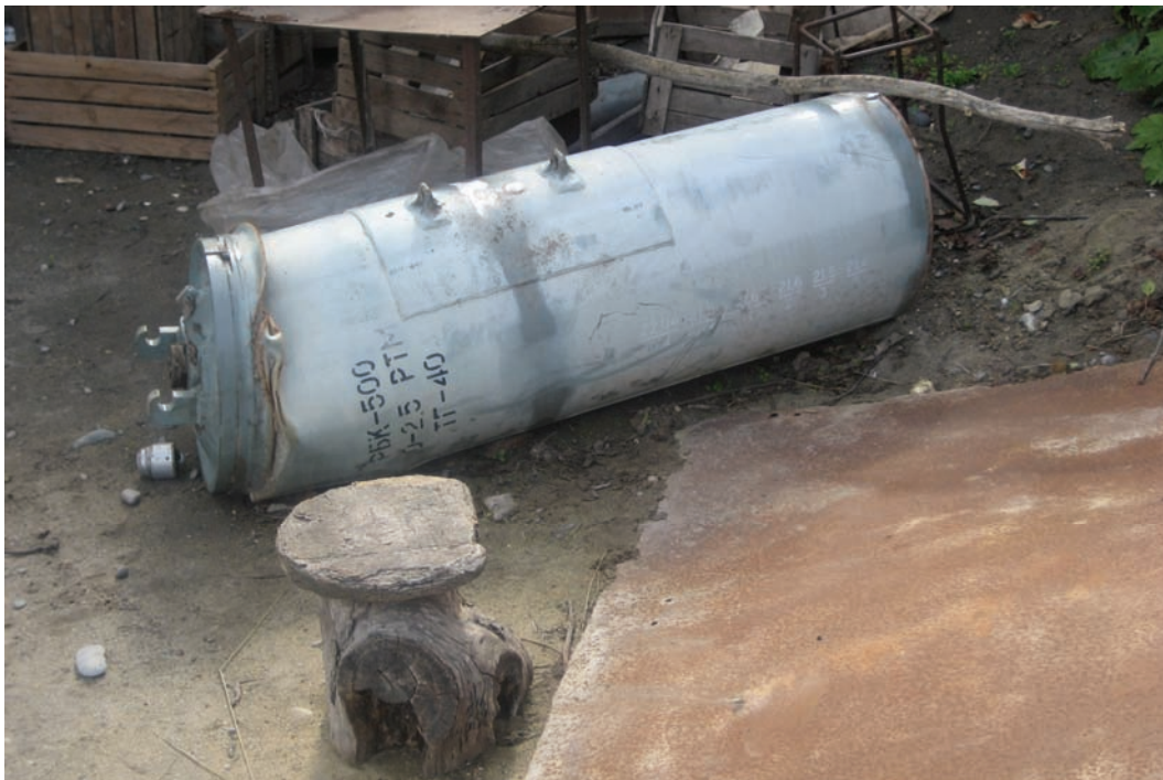
This Russian, air-dropped RBK-500 cluster munition was found near the birzha , or gathering place, in Variani. The RBK-500, shown on October 18, 2008, carried AO-2.5 RTM submunitions.