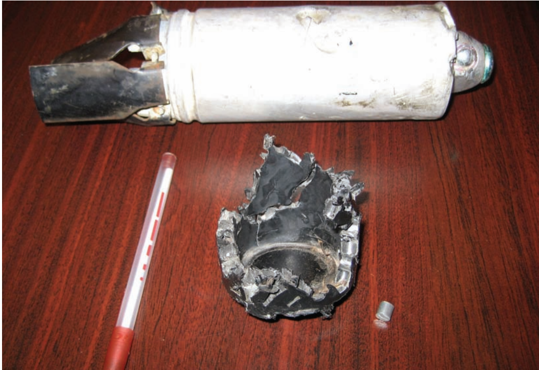
A Russian 9N210 submunition is shown here with its fragmentation core and a piece of fragmentation at a demining organization's office. The submunition, an antipersonnel and anti-materiel weapon, is carried in Uragan (Russian for Hurricane) rockets.