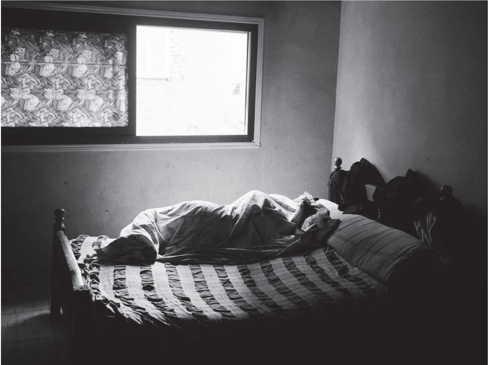
An Eritrean trafficking victim sleeps at a safe house in Cairo, Egypt on May 2, 2013. Some trafficking victims who escape from or are released by their captors in Sinai find their way to Bedouin community leaders who help them travel to Cairo where various NGOs help them.