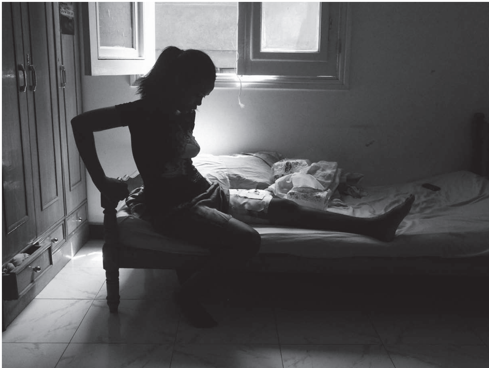
An Eritrean trafficking victim recovers from skin transplant surgery in Cairo, Egypt after traffickers in Sinai chained her ankles causing a severe infection. Trafficking victims have described to Human Rights Watch and other NGOs how traffickers chained them—often to one another—for months on end, while abusing them, including by raping women in front of other trafficking victims.