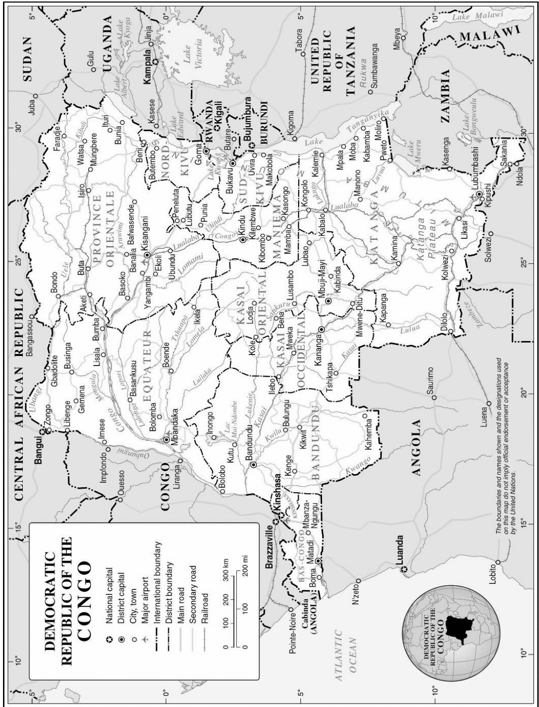
Map 1: Democratic Republic of Congo