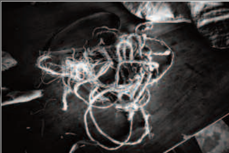
Cords used to tie up victims found at one massacre site.