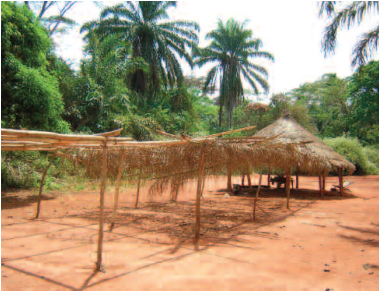
The paillote (a makeshift thatched marquee) outside the Catholic church in Batande where people had gathered for Christmas lunch when the LRA attacked. At least 82 people were brutally slaughtered.