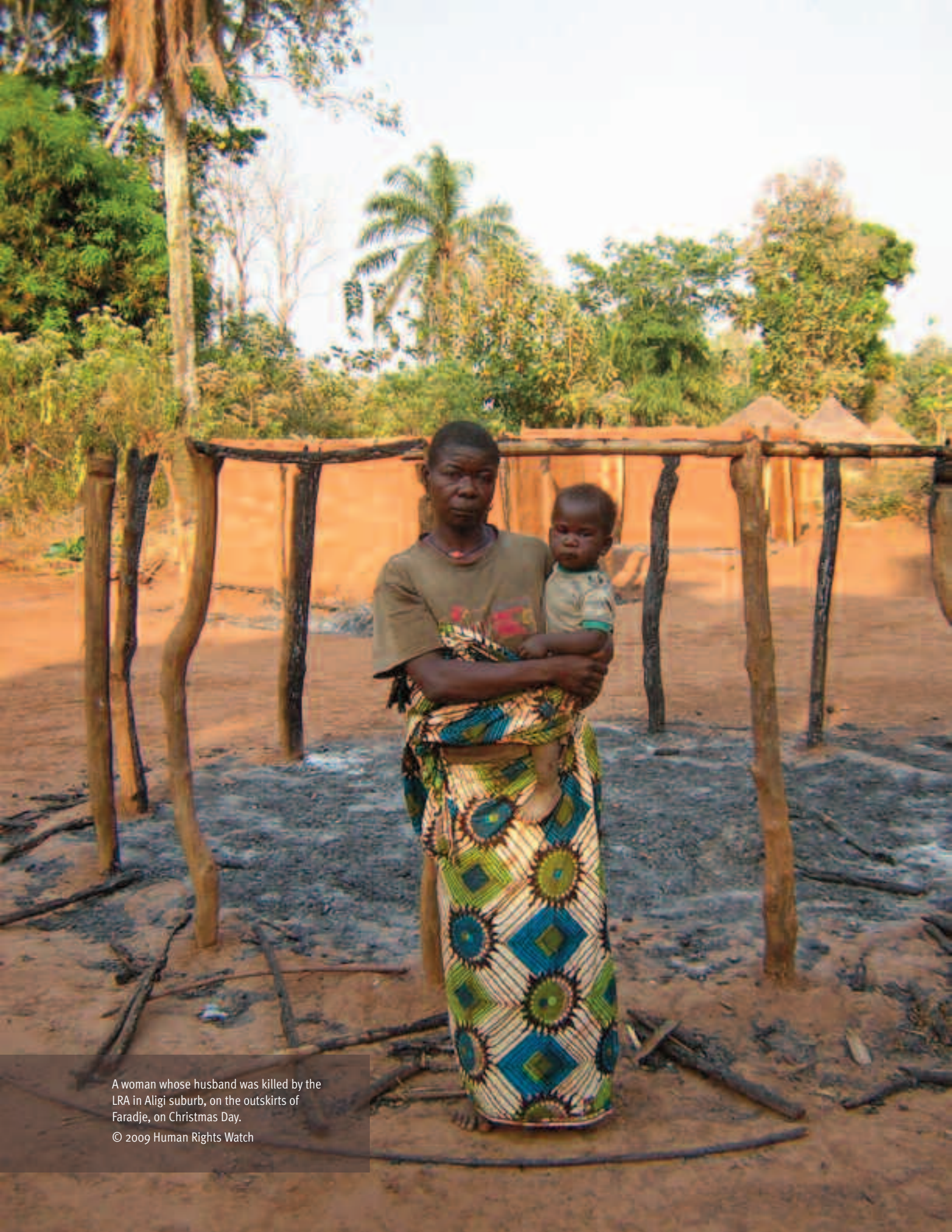
A woman whose husband was killed by the LRA in Aligi suburb, on the outskirts of Faradje, on Christmas Day.