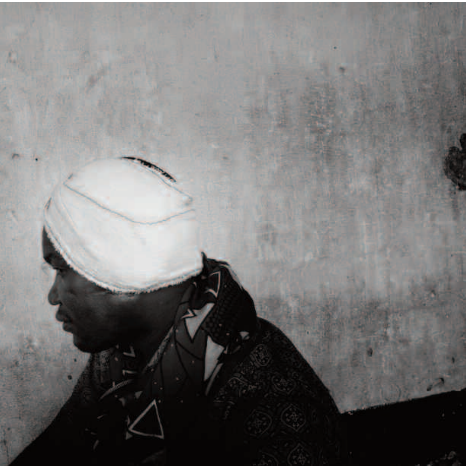
A victim of the Christmas day attacks in Faradje. The LRA beat him and cut off his ear.