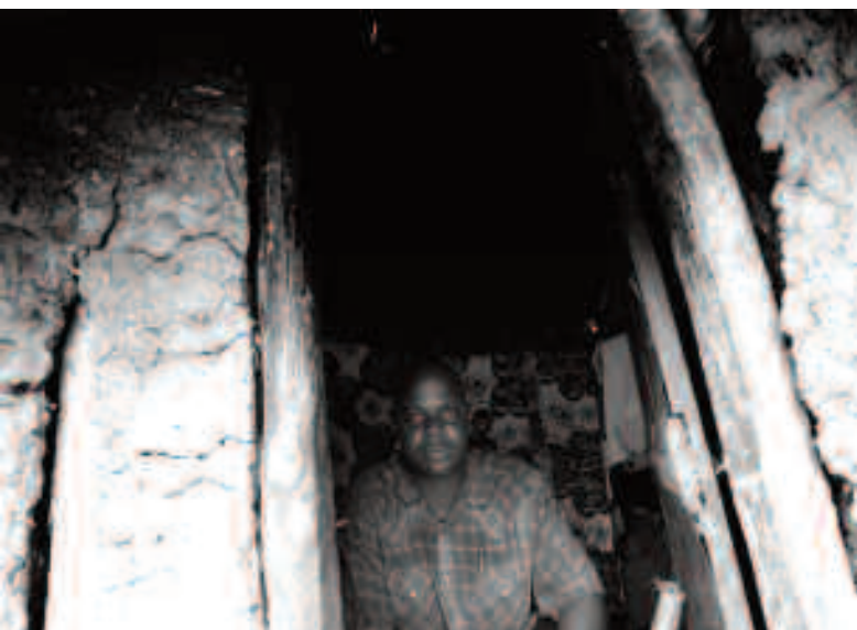
A headmaster from a local school near Dungu who narrowly escaped being killed by the LRA. The LRA abducted 65 of his students, many of whom have not returned.