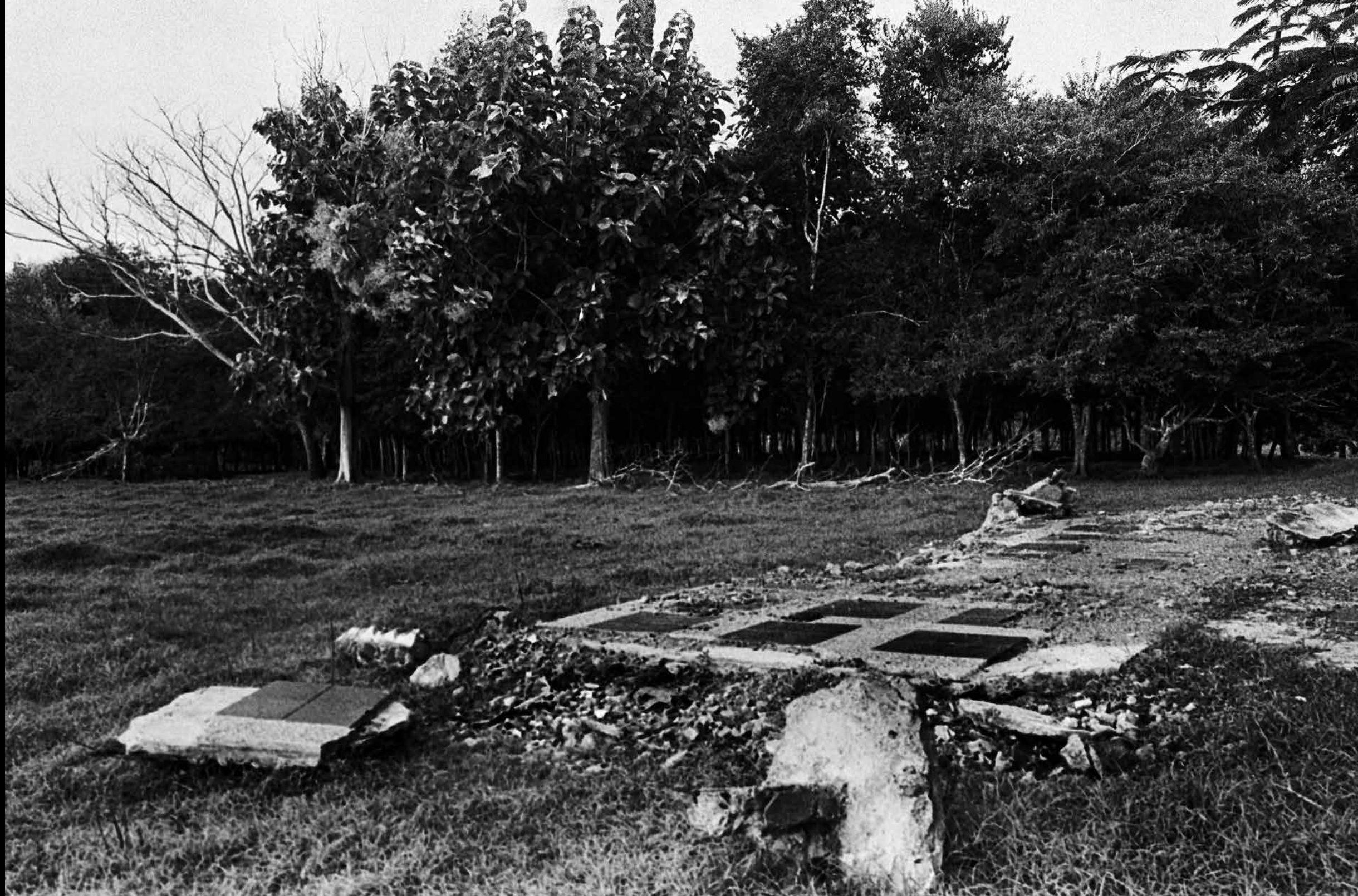
Remains of a primary school that was destroyed after paramilitaries forced Santa Paula residents off their land. Leticia, Córdoba, July 2012.