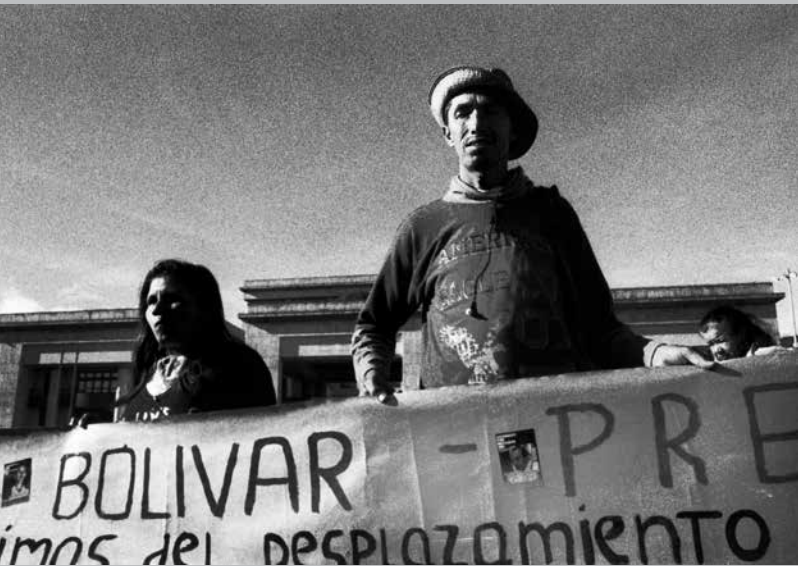
A demonstration in front of the Colombian Congress demanding land restitution and an end to threats against land activists. Bogotá, July 2012.

the teams should conduct systematic investigations of these “situations,” taking advantage of the concentration of regional complaints to pursue evidence of links between cases in order to identify patterns and all responsible parties. (It is important to note, however, that not all people who moved onto or acquired land being reclaimed by IDPs bear criminal liability for the acquisition of such land.)