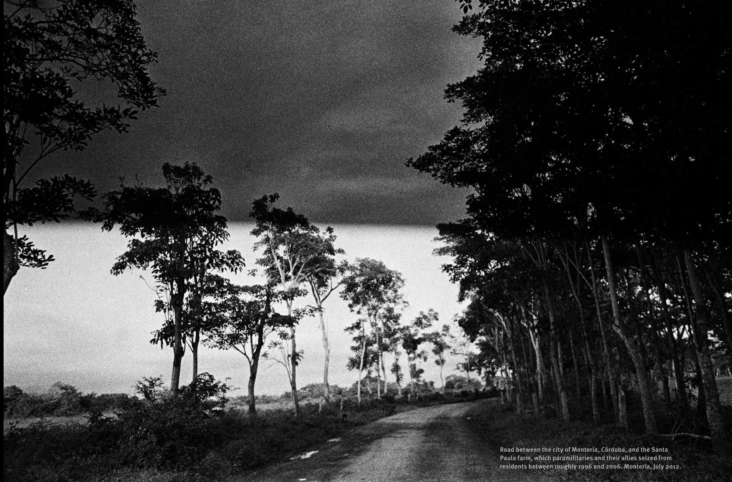
Road between the city of Montería, Córdoba, and the Santa Paula farm, which paramilitaries and their allies seized from residents between roughly 1996 and 2006. Montería, July 2012.

Effective efforts to combat successor groups—including by breaking their links with security forces in certain regions—should be seen as an essential precondition for effective implementation of the Victims Law.