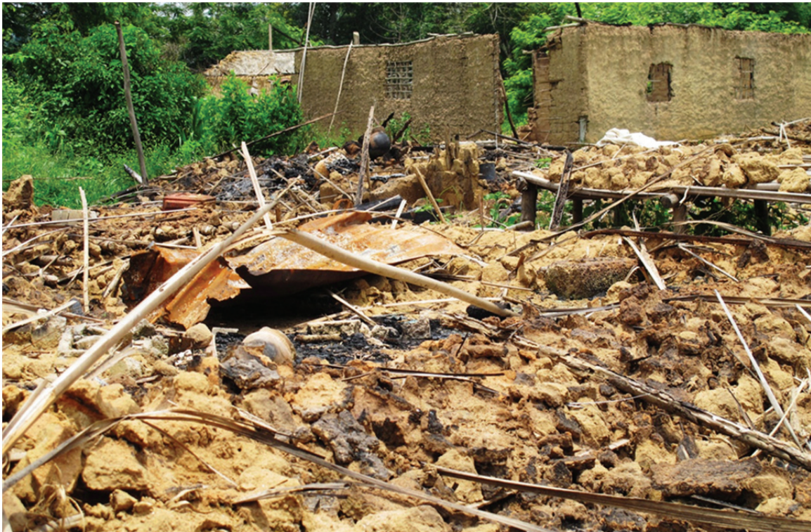
Houses destroyed in the village of Petit-Guiglo, which came under attack on March 23, 2013. As in Zilébly, the attack appeared to be motivated at least in part by land dispossession linked to the post-election crisis. April 26, 2013.

In addition to the cross-border attacks from Liberia, Human Rights Watch documented several inter-communal clashes in western Côte d'Ivoire related to land disputes involving formerly displaced persons. In early February 2013, Guéré residents from the neighboring villages of Zomplou and Babli-Vaya skirmished, resulting in several minor injuries and at least one serious injury, when a youth from Babli-Vaya struck a youth from Zomplou with a piece of wood. 163 Residents of Zomplou allege that youth from Babli-Vaya illegally sold hundreds of hectares of their virgin forest while they were displaced by the crisis. A Zomplou resident who was among those demanding restitution said that more clashes were likely if local authorities do not quickly resolve the dispute: