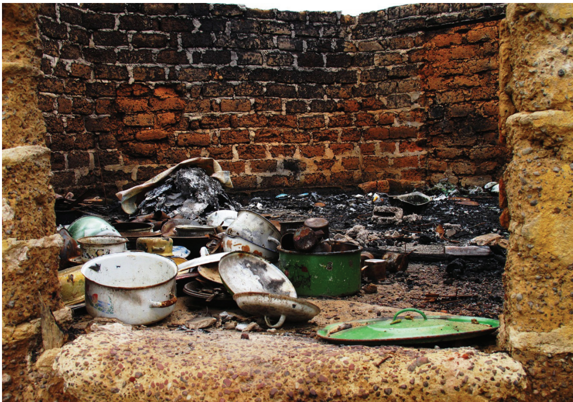
A burnt house in Zilébly village, which was attacked on March 13, 2013 by people who crossed over from Liberia. The attackers appeared to target people who were seen as associated with allegedly illegal land sales that stripped refugees of their land. April 26, 2013.

The investigation points toward a settling of scores linked to land conflict. According to local authorities, natives, complaining that their land had been sold by their neighbors while they were displaced by the crisis, have threatened these villagers with reprisals.... During the attack, the assailants burned houses of [Guéré landowners] and executed four Burkinabés. The bodies of these Burkinabés ... were mutilated. 156