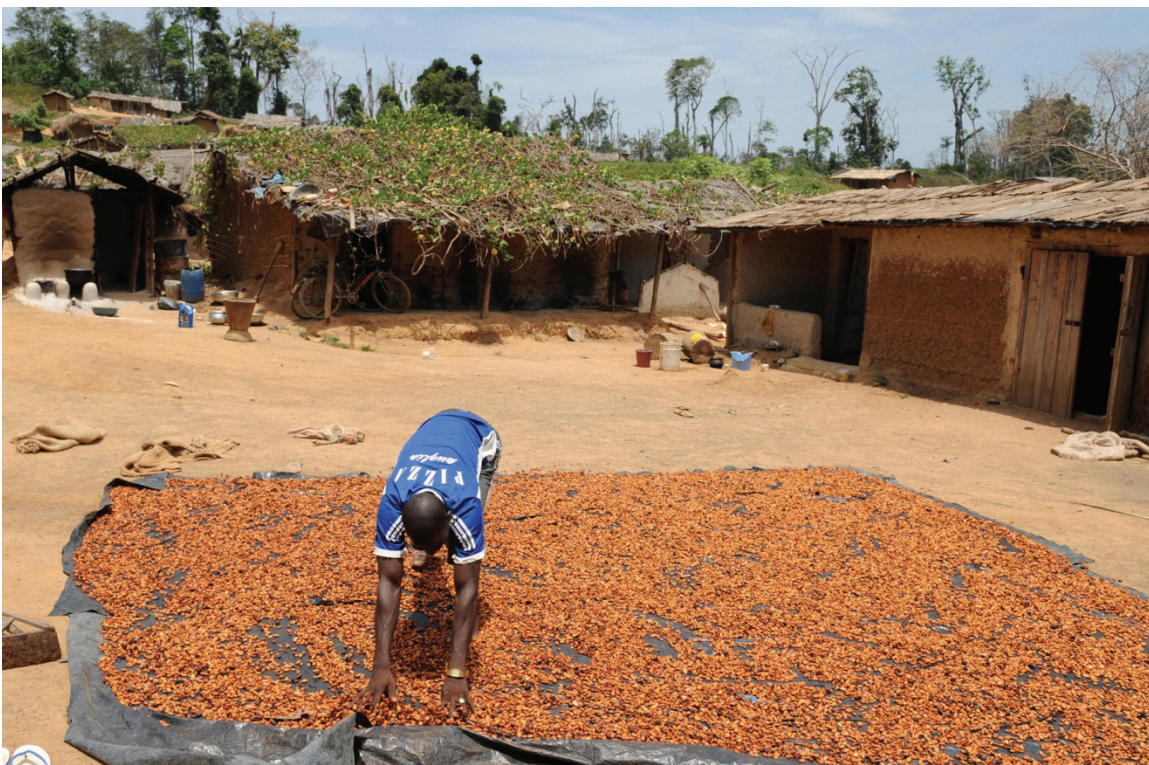
A cocoa farmer spreads cocoa beans that will dry under the sun in the village of Cantondougou, 360 kilometers west of Abidjan, April 23, 2009.

During the 1990 and 1995 elections, politicians' speeches encouraged indigenous people from the forest regions to believe that the rise to power of the opposition leader Gbagbo would lead to the expropriation of land from non-native and non-indigenous peoples and its subsequent reallocation. By taking up the 'land for indigenous people' slogan incorporated in the Land Act on the eve of the 2000 presidential, legislative and municipal elections, politicians aimed to attract voters while reinforcing the principle of reclaiming land.... 29