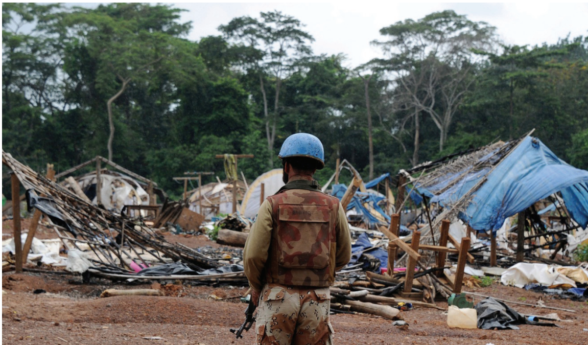
A UN peacekeeper stands near the destroyed Nahibly displaced persons camp near Duékoué, July 22, 2012. On July 20, members of the Ivorian military and allied forces burned down the camp, which then housed around 4,500 people, and summarily executed or disappeared some people who fled.

soldiers and allied forces burned to the ground the Nahibly IDP camp in July 2012, which housed around 4,500 people still displaced after the crisis. 61 The International Federation for Human Rights (FIDH) has reported verifying at least six summary executions by FRCI soldiers and the “disappearance of dozens of displaced persons.” 62 FIDH said that there may be up to 13 mass graves linked to the Nahibly attack, including a well in which six bodies were found in October 2012. 63