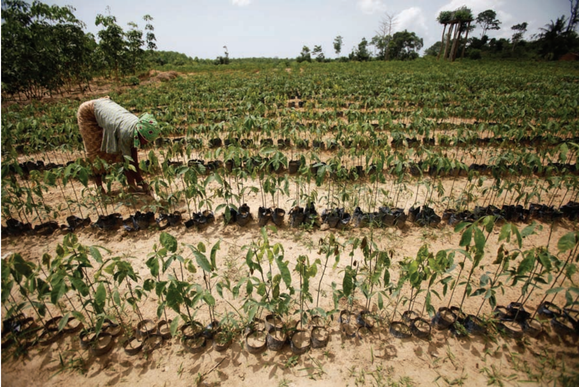
A woman works on a plantation of rubber seedlings near San Pedro. Despite their regular involvement in working the land in Côte d'Ivoire, many women face discrimination in formalizing their claims to land ownership. March 9, 2012.