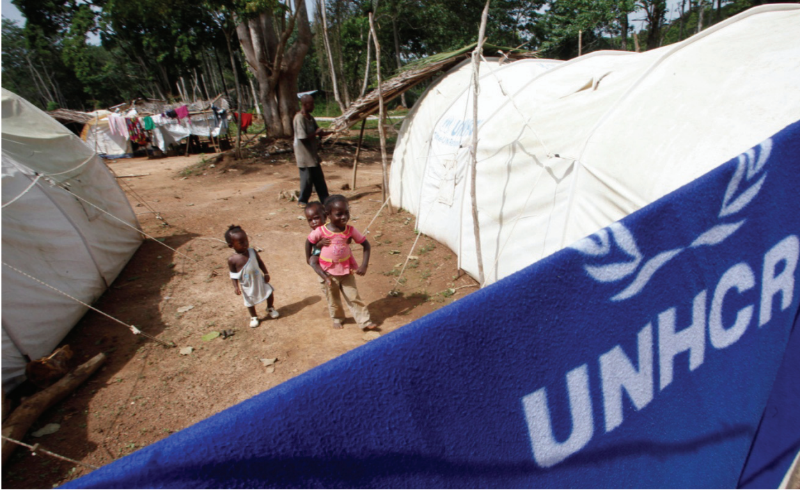
Children walk in an Ivorian refugee camp, commonly known as PTP camp, in Grand Gedeh County, eastern Liberia, on May 22, 2012. More than 58,000 Ivorian refugees remain in Liberia as of August 2013, including more than 11,000 at PTP camp.

Most of the several dozen Ivorian refugees interviewed in Liberia in December 2012 cited land dispossession as among the main reasons why they feel unable to return to Côte d'Ivoire. Other reasons included what they perceived to be a lack of security for pro-Gbagbo supporters and, relatedly, the lack of progress on disarmament. A Liberian refugee official in Zwedru similarly told Human Rights Watch that refugees cited two main reasons for not returning to Côte d'Ivoire: first, security; and second, because of the alleged occupation of their land. 168