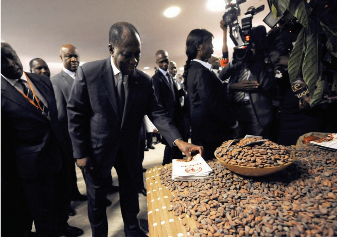
President Alassane Ouattara (center) looks at a stand of cocoa during the 2012 World Cocoa Conference in Abidjan. President Ouattara has said that resolving conflicts related to land tenure is a key priority for his government.