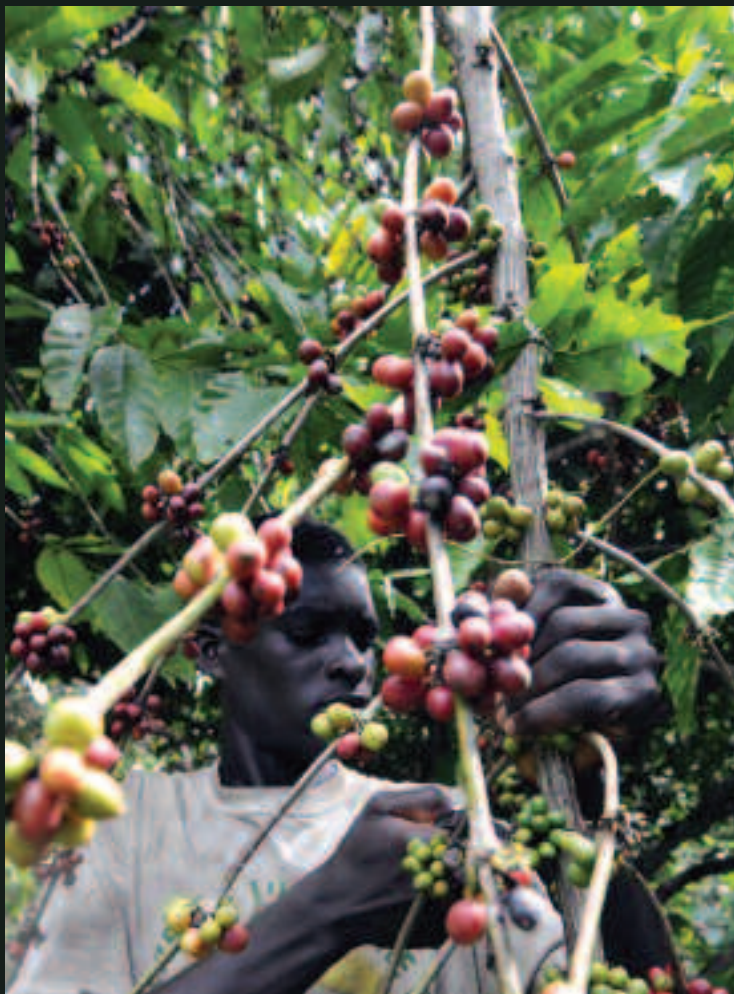
(left) A man picks coffee beans on a coffee and cocoa plantation in Divo, central-western Côte d'Ivoire, October 22, 2010.