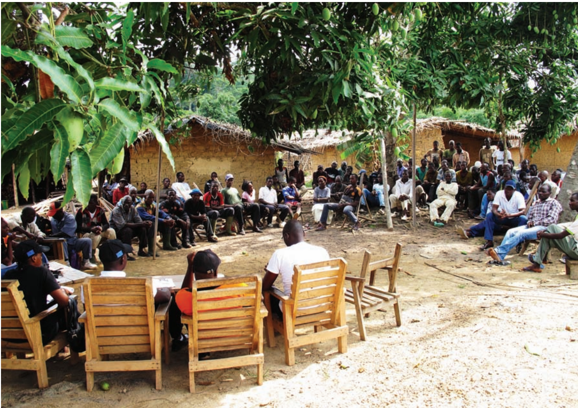
A community meeting in the village of Diouya-Dokin, organized by the Norwegian Refugee Council, to try to find solutions regarding disputed parcels of land. Village authorities play a crucial role in resolving land conflicts in western Côte d'Ivoire. April 25, 2013.

Finally, some village chiefs in western Côte d'Ivoire are part of the problem: Tied up in politics or even involved in illegal land sales themselves, they are unable to play the role of a neutral arbiter. There also do not appear to be clear procedures—for example, in how the village land committees take and consider evidence before making their decision—which increases the potential for unjust results when customary authorities are not neutral.