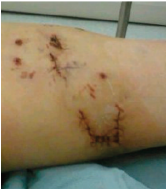
(left) Dog bite wounds are shown on the left leg of a 12-year old girl who was attacked by a police dog in 2012 when police searched for and arrested her after she was reported to have sprayed someone with bear mace.

(opposite page) A community worker in a northern British Columbia town holds underwear that she distributes to women on the street, some of whom reported to her having been raped by police and having their underwear taken.