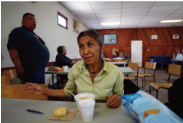
In Terrace, British Columbia, a woman discusses how police told her it was “too early” for them to do anything when she reported that her grandniece (whom she considers her granddaughter) had been missing for 14 hours. She said she told the police: “There are enough girls missing out there already, I want to know where my granddaughter is.”