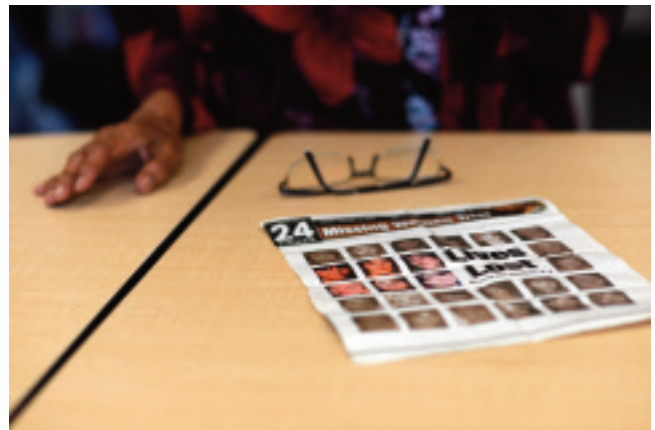
A woman shows a paper she has kept displaying the photos of women, some of whom she knew, who disappeared from the downtown eastside of Vancouver, British Columbia, in the 1990s.