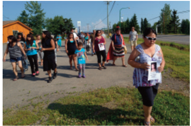
Community members participate in a spirit healing walk in Burns Lake, British Columbia, in remembrance of missing and murdered women.