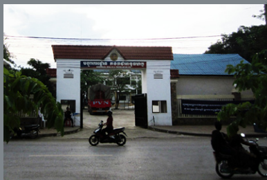
Battambang Gendarme Center 13.0952N, 103.1958E Run by: Gendarmerie Approximate capacity: 100