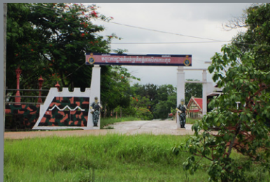
Koh Kong Military Center 11.6204N, 103.0075E Run by: Military Approximate capacity: 30