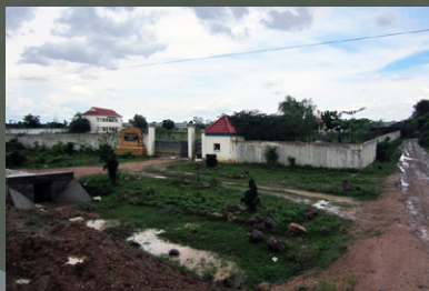
Battambang Bavel Police Center 13.1773N, 102.8141E Run by: Police Approximate capacity: 100