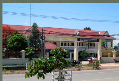
Siem Reap Police Center 13.3939N, 103.8164E Run by: Police Approximate capacity: 50