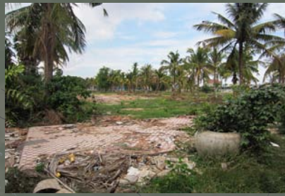
Choam Chao “Youth Rehabilitation Center”