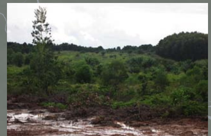
Planned “National” Center