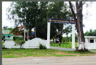
Preah Sihanouk Gendarme Center 10.6148N, 103.5656E Run by: Gendarmerie Approximate capacity: 30