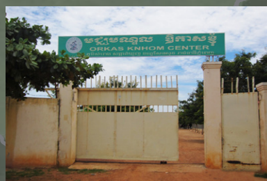
Phnom Penh Orgkas Khnom Center 11.6138N, 104.8494E Run by: Phnom Penh Municipality Approximate capacity: 400