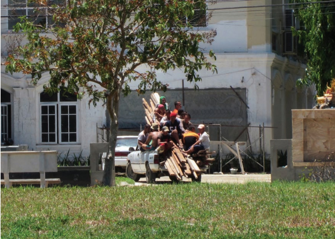
Young men who had been working under gendarme supervision on the construction site of a hotel in Battambang are driven in a pickup towards the gendarme-run drug detention center.

pickup truck with gendarme license plates and loaded with the young men then drove from the construction site in the direction of the gendarme center in Battambang town. However, the destination of the pickup could not be confirmed.