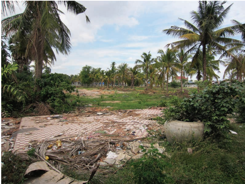
The frond-strewn floor of a former building inside the Choam Chao “Youth Rehabilitation Center” in Phnom Penh. Cambodia closed the center in 2010.

One of the three centers closed since 2010 was the Choam Chao “Youth Rehabilitation Center,” which was situated in Phnom Penh and run by the Ministry of Social Affairs up until 2010. The center had the capacity to detain approximately 100 people. It ceased to operate in mid-2010 after the United Nations Children’s Fund, UNICEF, which had provided funding since 2006, confirmed reports of abuses against detainees and stopped funding the center. 26 In late 2012, the center’s buildings were demolished.