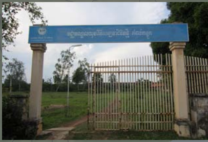
Kampong Kantuot “Youth Rehabilitation Center”