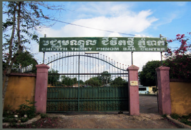
Banteay Meanchey Phnom Bak Center 13.5882N, 102.9348E Run by: Social Affairs Ministry Approximate capacity: 120