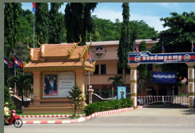
Banteay Meanchey Gendarme Center 13.5881N, 102.967E Run by: Gendarmerie Approximate capacity: 200