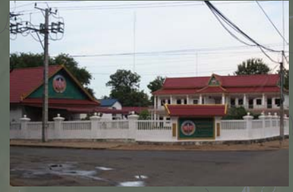
Kampong Cham Gendarmerie Center