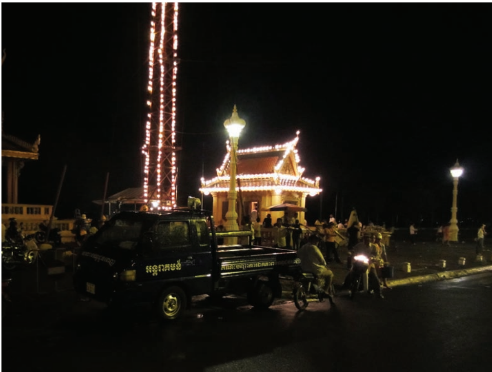
An “intervention” truck from the Daun Penh district police in Phnom Penh. Such trucks are used to transport the police who carry out “street sweeps” of drug users and other people considered “undesirable” by authorities.

People who use drugs in Cambodia are not the only people considered “undesirable” by authorities. In early 2012, local media quoted an official at Phnom Penh’s Social Affairs department explaining that beggars and sex workers make the city “messy” and that rounding them up was necessary to “keep public order and make the city beautiful for ASEAN.” He said, “We’ve taken them for training.” 48 In fact, homeless people, beggars, street children, sex workers, and people with actual or perceived disabilities are routinely held in drug detention centers.