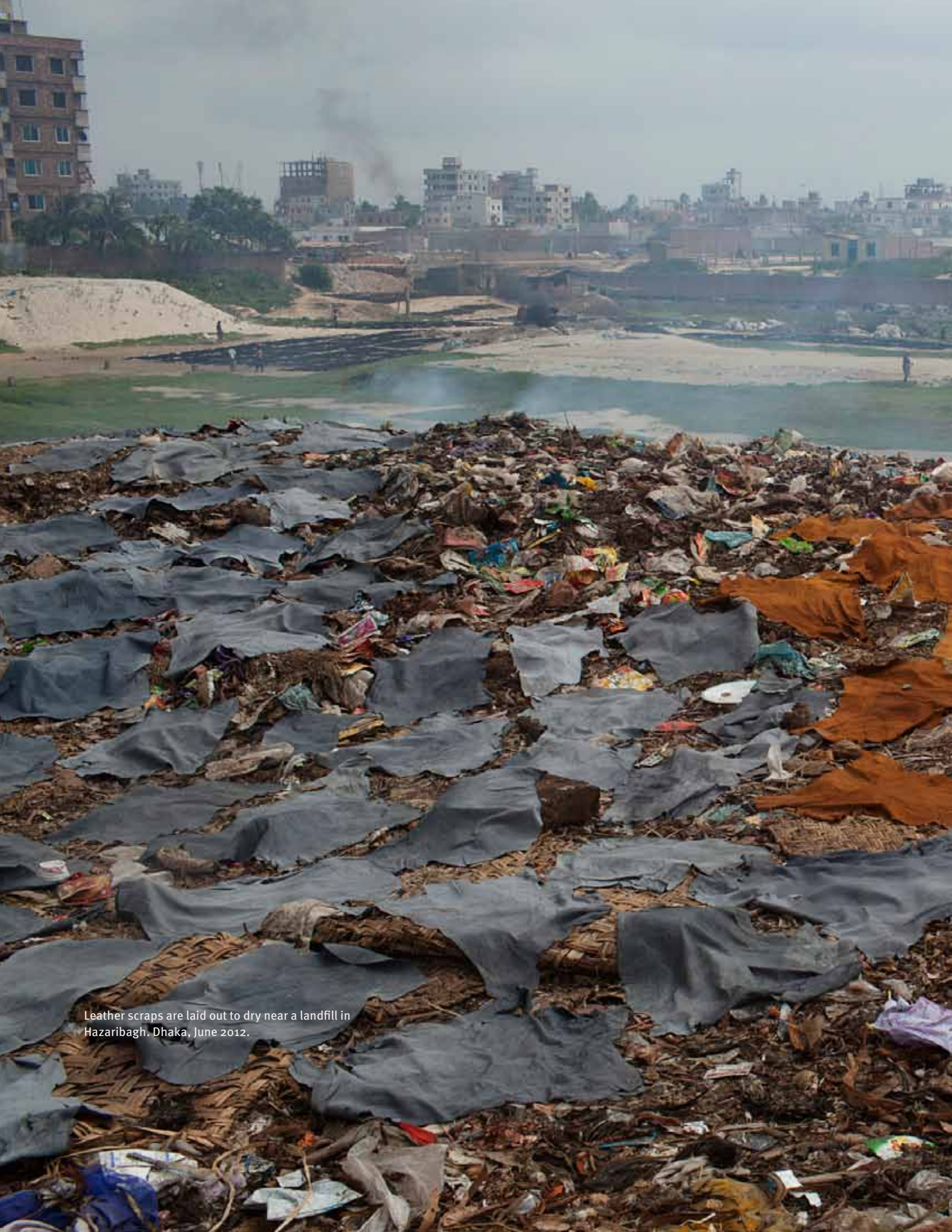
Leather scraps are laid out to dry near a landfill in Hazaribagh, Dhaka, June 2012.