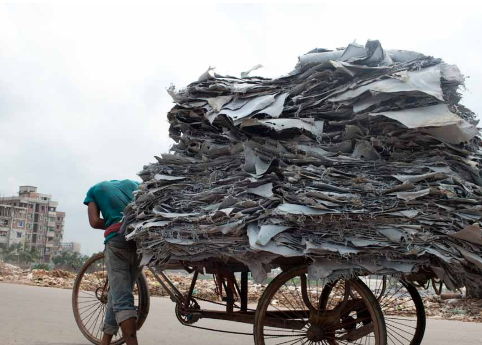
A worker transports dried leather to a tannery. Dhaka, June 2012.

In June 2012, the chairman of the Bangladesh Finished Leather, Leather Goods and Footwear Exporters Association told Human Rights Watch that while the group was “hopeful” that the government will meet its demands, failure to do so would mean “it won’t be possible to shift and this [situation] will be the government’s liability.”