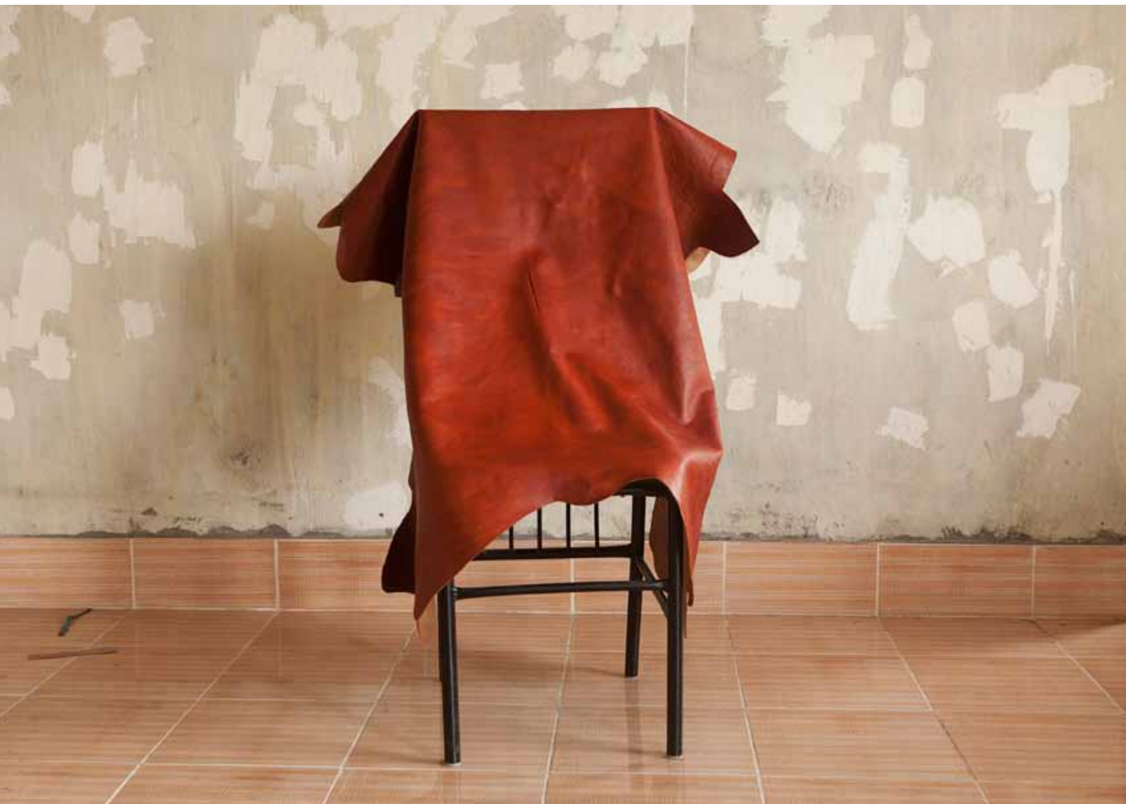
A sample of finished leather dries at a chemical factory in Hazaribagh. Dhaka, Bangladesh June 2012.

High Court then ruled in 2009 that the government should ensure that the Hazaribagh tanneries relocate outside of Dhaka or close them down. The government and the tannery associations sought (and were granted) a number of extensions to that order, and then ignored the order when those extensions lapsed.