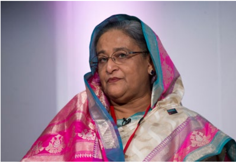
At the July 2014 Girl Summit in London, Bangladesh’s Prime Minister Sheikh Hasina promised to end marriage for girls under the age of 15 by 2021 and reduce by more than one-third the number of girls between the ages of 15 and 18 who marry. She also promised to end all child marriage by 2041. As part of this effort, she pledged that her government would revise the Child Marriage Restraint Act (CMRA) and develop a national plan of action on child marriage before 2015. Her government has since proposed that the age of marriage for girls be lowered from 18 to 16.

Bangladesh’s government has responded to the growing attention to the harms linked to child marriage by promising swift action. At the July 2014 Girl Summit in London, Bangladesh’s Prime Minister