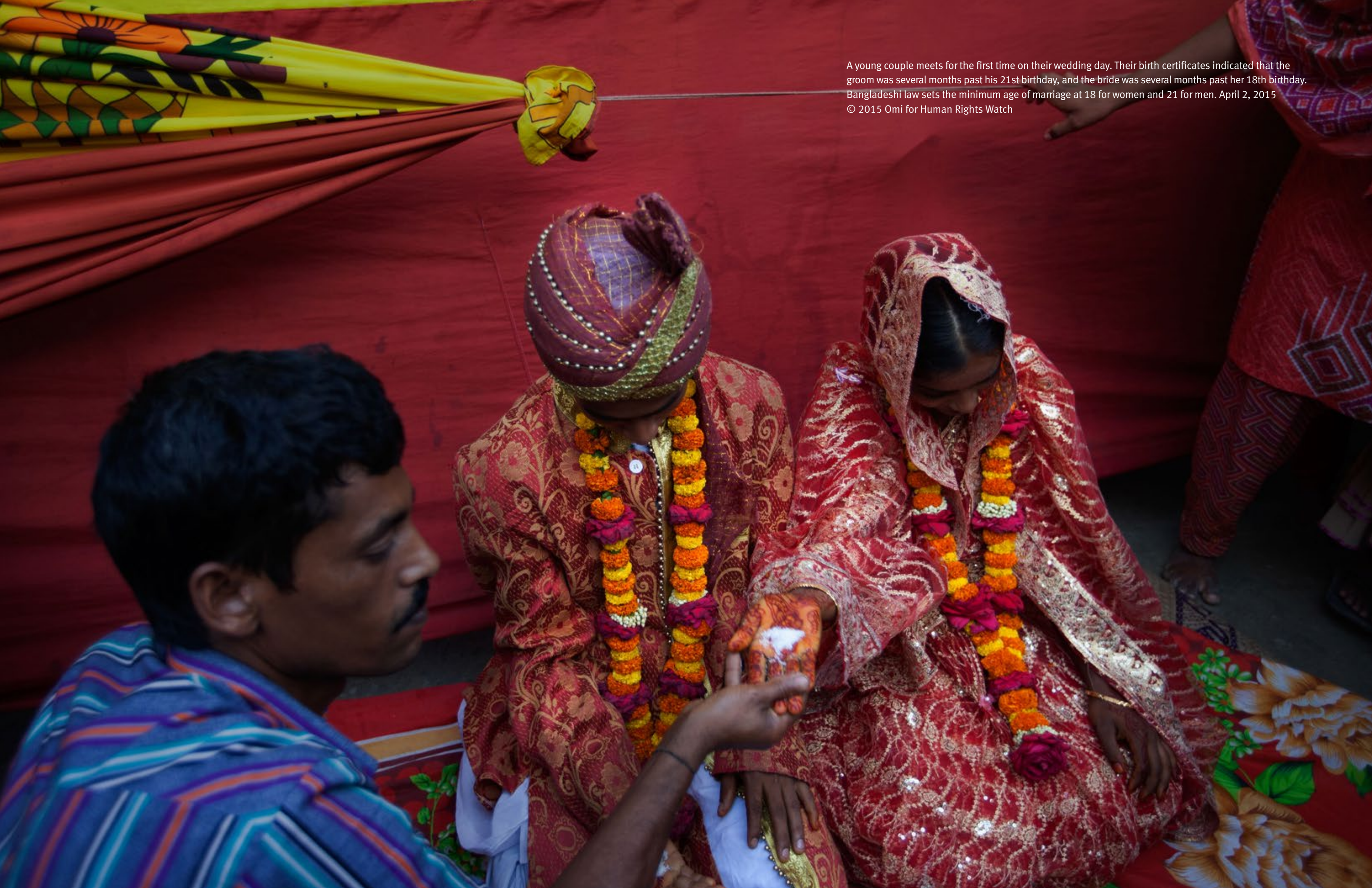
A young couple meets for the first time on their wedding day. Their birth certificates indicated that the groom was several months past his 21st birthday, and the bride was several months past her 18th birthday. Bangladeshi law sets the minimum age of marriage at 18 for women and 21 for men. April 2, 2015