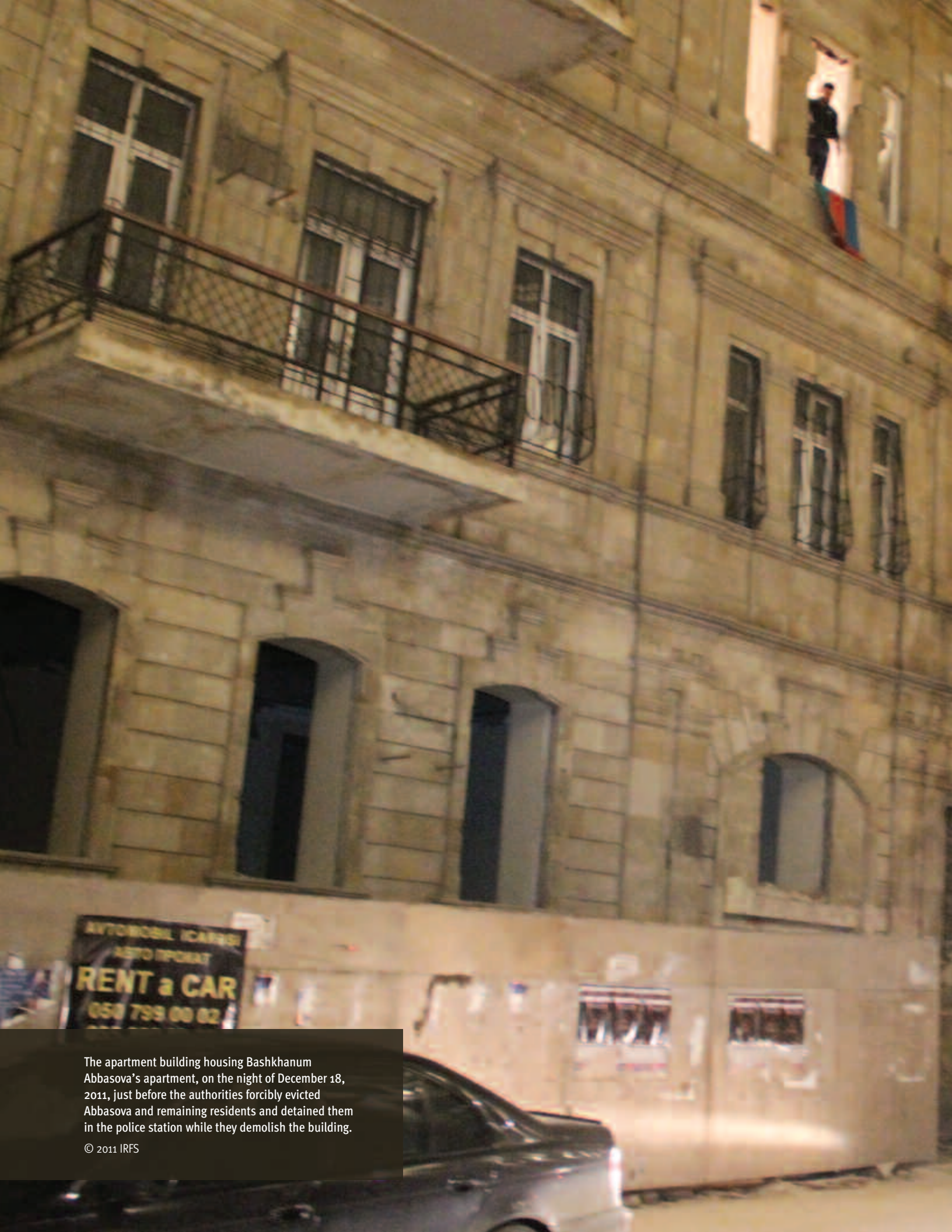
The apartment building housing Bashkhanum Abbasova's apartment, on the night of December 18, 2011, just before the authorities forcibly evicted Abbasova and remaining residents and detained them in the police station while they demolish the building.