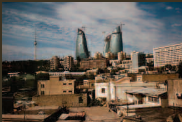
The Flame Towers are emblematic of new construction in Baku.

Human Rights Watch calls on the Azerbaijani government to halt all further expropriations, evictions, and demolitions until they can be carried out in a manner consistent with Azerbaijani law and international human rights law. The prosecutor’s office should initiate an independent inquiry into why the expropriations and demolitions in central Baku have been allowed to take place in a manner that clearly violates Azerbaijani and international law.