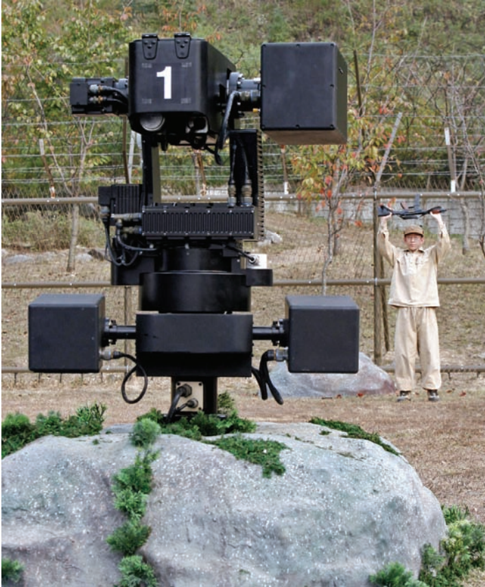
The South Korean SGR-1 sentry robot, a precursor to a fully autonomous weapon, can detect people in the Demilitarized Zone and, if a human grants the command, fire its weapons. The robot is shown here during a test with a surrendering enemy soldier.

Zone (DMZ) for testing in 2010. 42 These stationary robots can sense people in the DMZ with heat and motion sensors and send warnings back to a command center.