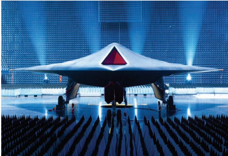
The United Kingdom's Taranis combat aircraft, whose prototype was unveiled in 2010, is designed to strike distant targets, “even in another continent.” While the Ministry of Defence has stated that humans will remain in the loop, the Taranis exemplifies the move toward increased autonomy.

responded, “This is a very sensitive area we are paying a lot of attention to.” 65 He thus left the door open to the possibility of greater autonomy in the future. 66