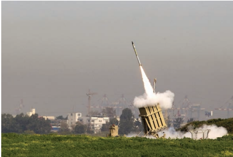
An Iron Dome, an Israeli automatic weapons defense system, fires a missile from the city of Ashdod in response to a rocket launch from the nearby Gaza Strip on March 11, 2012. The Iron Dome sends warnings of incoming threats to an operator who must decide almost instantly whether to give the command to fire.

80 percent success rate, “has shot down scores of missiles that would have killed Israeli civilians since it was fielded in April 2011.” 32 In a split second after detecting an incoming threat, the Iron Dome sends a recommended response to the threat to an operator. The operator must decide immediately whether or not to give the command to fire in order for the Iron Dome to be effective. 33