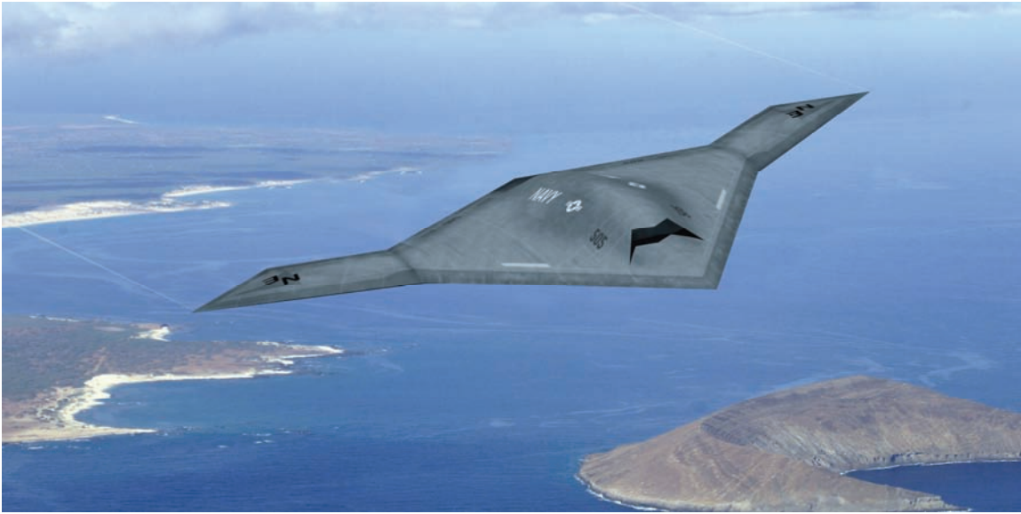
The US Navy's X-47B, currently undergoing testing, has been commissioned to fly with greater autonomy than existing drones. While the prototype will not carry weapons, it has two weapons bays that could make later models serve a combat function.

The United Kingdom unveiled a prototype of its Taranis combat aircraft in 2010. Designers described it as “an autonomous and stealthy unmanned aircraft” that aims to strike “targets with real precision at long range, even in another continent.” 61 Because Taranis is only a prototype, it is not armed, but it includes two weapons bays and could eventually carry bombs or missiles. 62 Similar to existing drones, Taranis would presumably be designed to launch attacks against persons as well as materiel. It would also be able to defend itself from enemy aircraft. 63 At this point, the Taranis is expected to retain a human in the loop. The UK Ministry of Defence stated, “Should such systems enter into service, they will at all times be under the control of highly trained military crews on the ground.” 64 Asked if the Taranis would one day choose its own targets, Royal Air Force Air Chief Marshal Simon Bryant