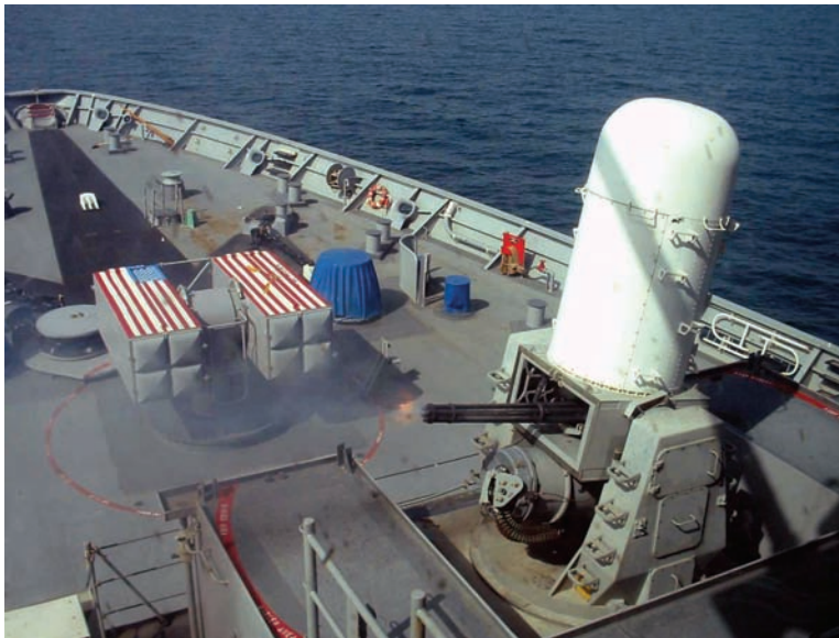
The US Navy's MK 15 Phalanx Close-In Weapons System is designed to identify and fire at incoming missiles or threatening aircraft. This automatic weapons defense system, shown during a live fire exercise, is one step on the road to full autonomy.

Automatic weapons defense systems represent one step on the road to autonomy. These systems are designed to sense an incoming munition, such as a missile or rocket, and to respond automatically to neutralize the threat. Human involvement, when it exists at all, is limited to accepting or overriding the computer's plan of action in a matter of seconds.