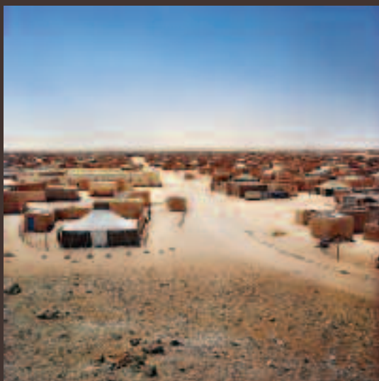
A Sahrawi refugee camp near Tindouf, Algeria, Tindouf.

In order to enhance human rights protections for the Sahrawi people, Human Rights Watch recommends that the U.N. Security Council enlarge the mandate of the MINURSO peacekeeping mission to include human rights monitoring both in Moroccan-controlled Western Sahara and the Tindouf refugee camps, or establish an alternative regular mechanism to monitor and report on conditions.