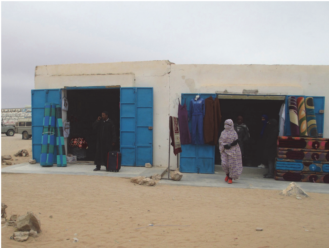
Shops in the market of Smara camp, where residents buy household goods as well as foods such as fruits, vegetables, and meat, which are not typically included in UN food aid.

important to refugees' ability to maintain basic nutrition and living standards. Trade and animal husbandry provide income, household goods, and meat, milk, vegetables, and fruits, which are not typically included in international food aid. 59 Livestock herders in the Tindouf area bring their animals to graze in the less arid lands in Polisario-controlled Western Sahara. Traders visit Tindouf and Mauritania to buy food and household goods. Fuel traders transport Algerian gasoline to Polisario-controlled Western Sahara and Mauritania for sale.