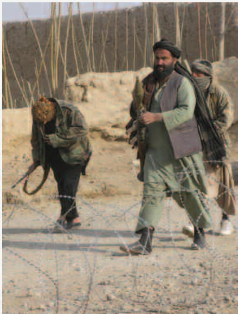
(above) Arbakai working with Afghan and ISAF forces, patrolling Gultepa area in Kunduz, January 2011.

Against this backdrop, we then provide an account of the ALP one year after it was created, detailing instances in which local groups are again being armed without adequate oversight or accountability. We conclude that unless urgent steps are taken to prevent ALP units from engaging in abusive and predatory behavior, the ALP could exacerbate the same perverse dynamics that subverted previous efforts to use civilian defense forces to advance security and public order.