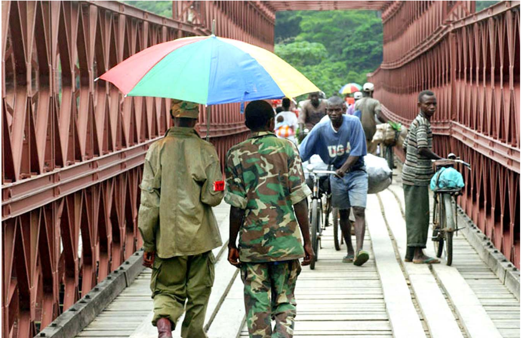
Dozens of military and police personnel were summarily executed at the Tshopo bridge by RCD troops following a May 14, 2002 attempted mutiny.