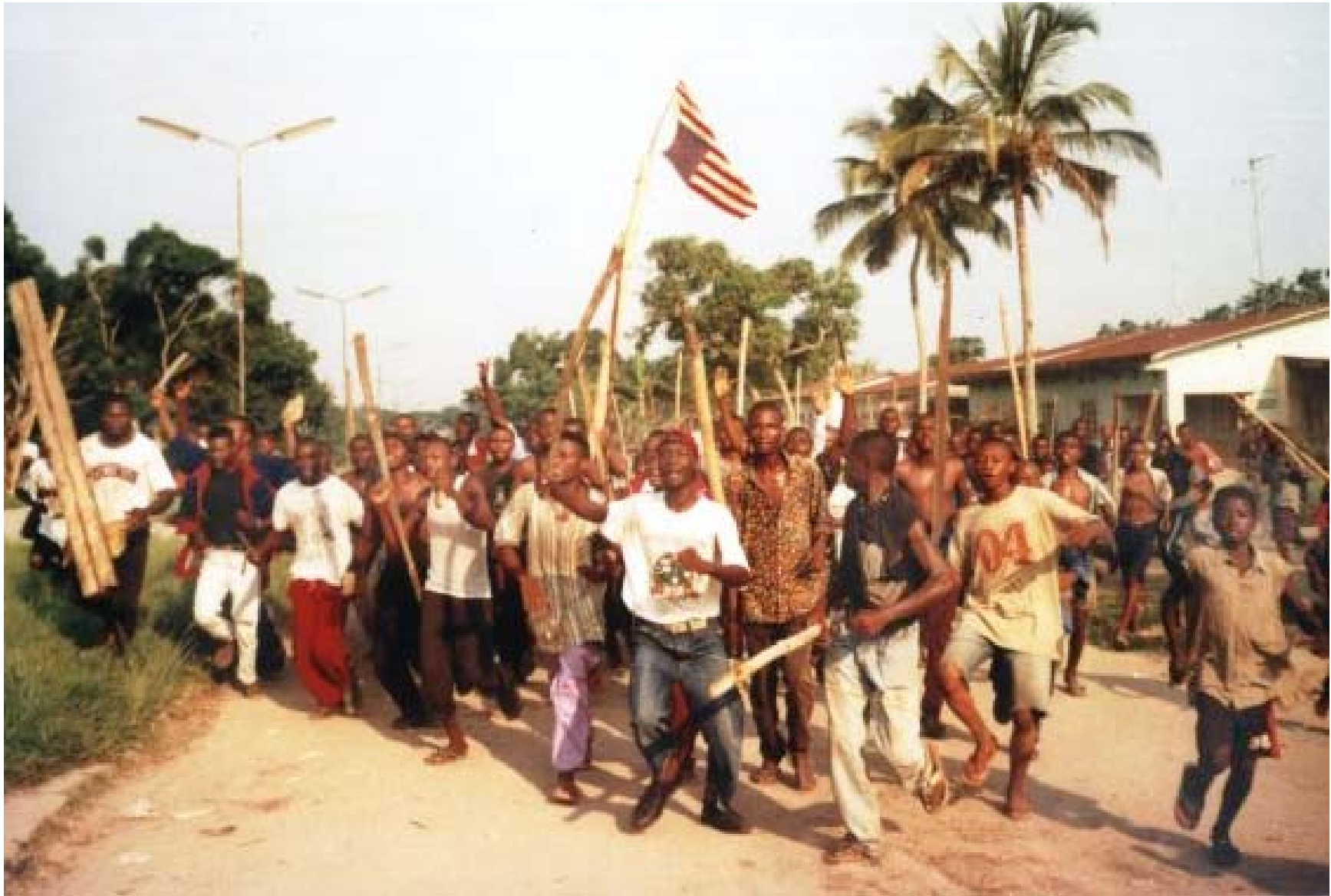
Youth belonging to the “Bana Etats-Unis” group, armed with machetes and spears, descend on the center of Kisangani in response to a radio call by mutineers to “push” the Rwandans out. May 14, 2002.