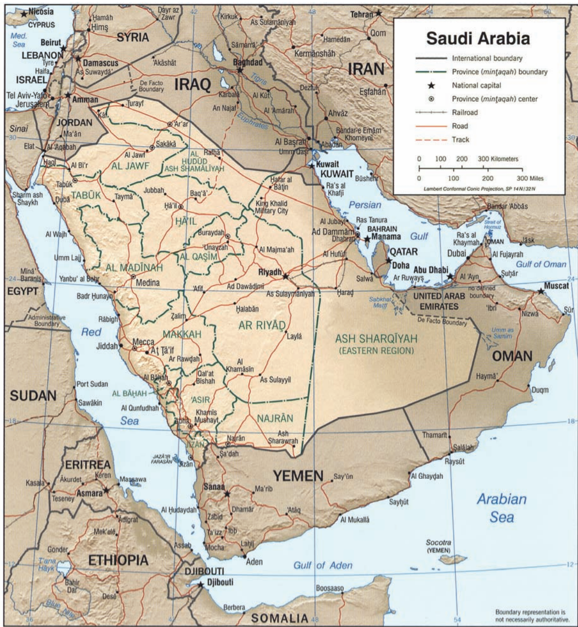
Map of Saudi Arabia.