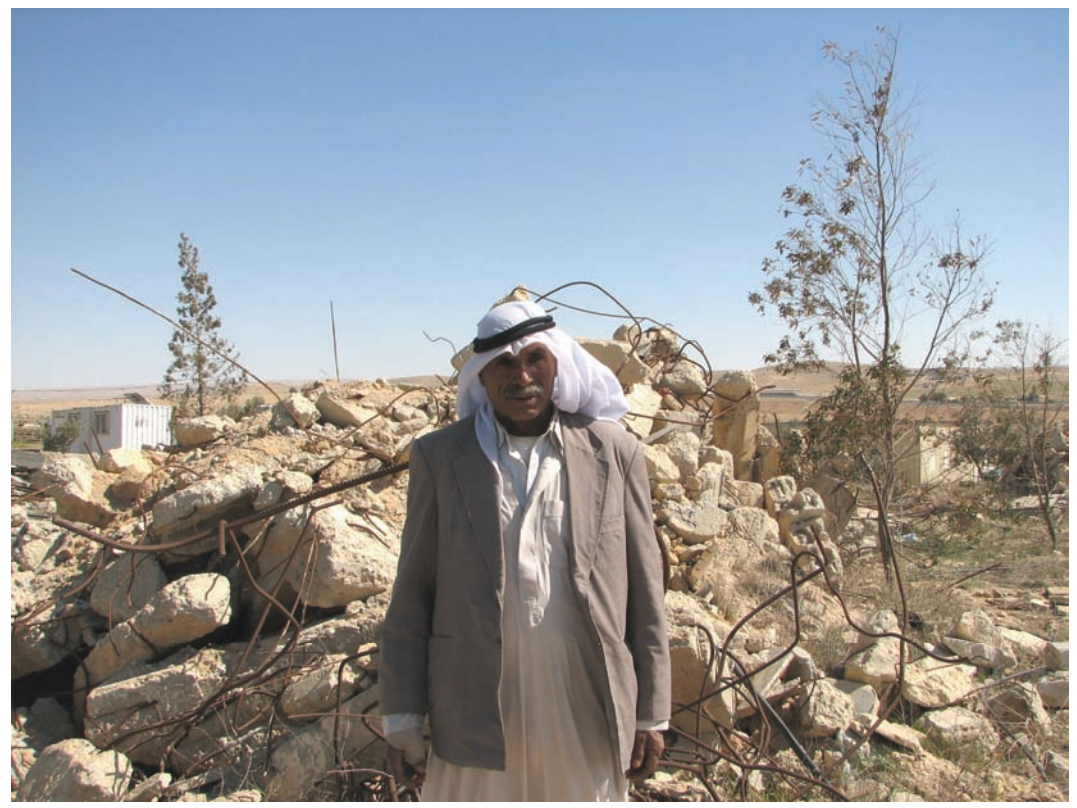
The brother referred to in the above testimony in front of ruins of his house demolished in 1993.

My brother was forced to demolish his house in 1993. The court decision was either a fine and jail or demolish the house himself. My brother had a beautiful house, and it was expensive to build. He had taken loans to build it, and then he had to demolish it. My brother served in the [Israeli] army his whole life and still lost his home.<sup>197</sup>