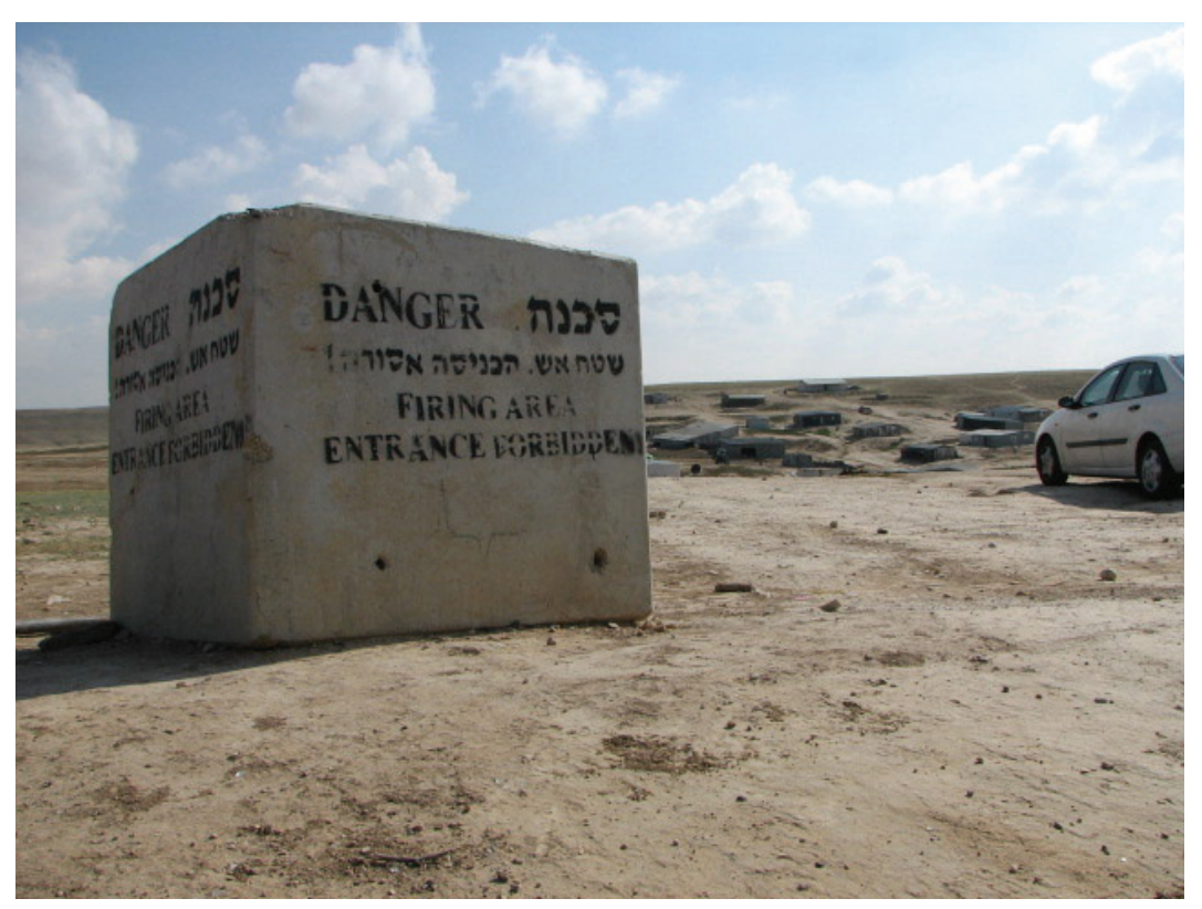
Firing Zone sign with unrecognized village in the background. A resident of a neighboring unrecognized village said the signs went up in the last couple of years, decades after the village was established.

Dr. Amer al-Hozayel described the signs in front of this village as part of the government's broader strategy for Bedouin land confiscation in the Negev: