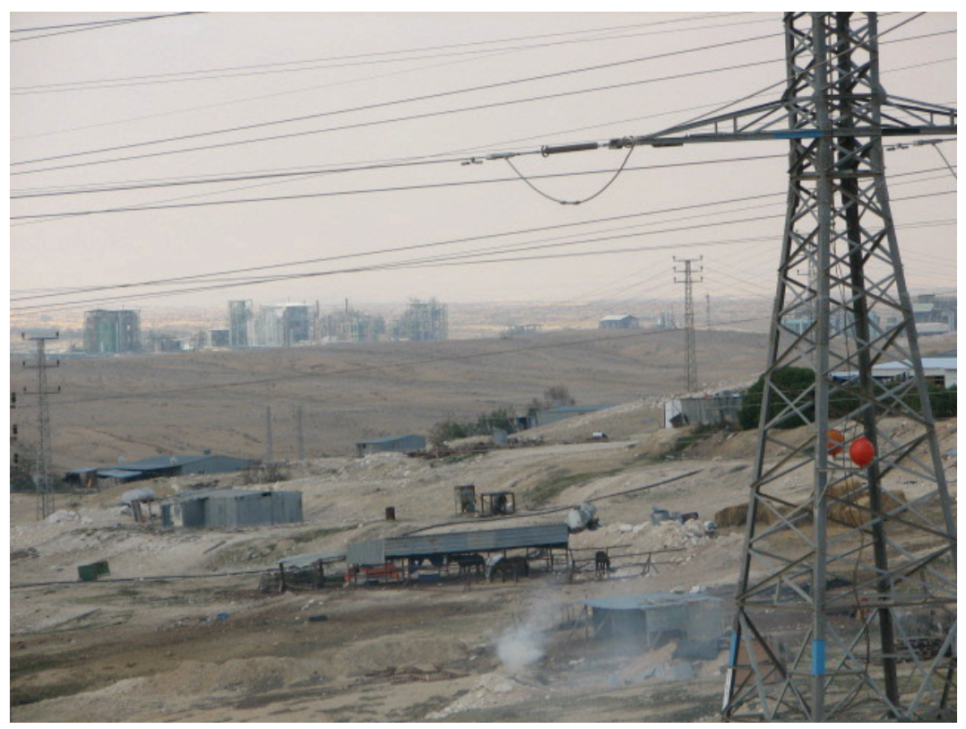
Houses in the unrecognized village of Wadi al-Ne'am, under electric wires and pylons with Ramat Hovav factories in the background.

percent of Israel's chemical factories and the country's only toxic waste dump. Noxious fumes pervade the area. In 2004, the Ministry of Health released a muchdelayed study documenting higher than normal cancer rates and high levels of hospitalization for respiratory illness near Ramat Hovav. Yet the authorities have consistently denied the Wadi al-Ne'am Bedouin's request to establish a new agricultural village in a different, non-toxic location. The only alternative the state has offered is a non-existent neighborhood in the already deeply deprived Bedouin township of Segev Shalom, still within the Ministry of Health's proscribed radius of Ramat Hovav. Today hundreds of families in Wadi al-Ne'am have demolition orders on their homes and nowhere to go.