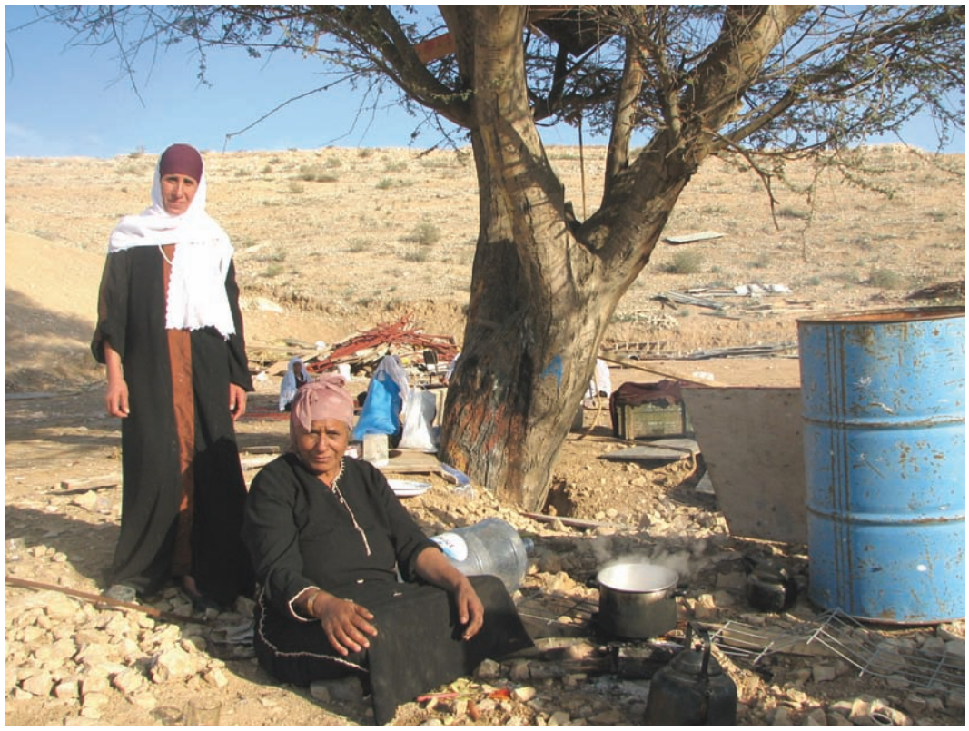
Women in Twayil cook outside after their homes were demolished.

On December 11, 8, 2007, officials from the Israel Land Administration, accompanied by hundreds of police, bulldozers, and trucks, entered the unrecognized Bedouin village of Twayil Abu Jarwal near the Goral junction in the Negev and demolished 20 structures. This was the last of eight times that ILA officials demolished homes of the al-Talalqah tribe in Twayil Abu Jarwal in 2007.