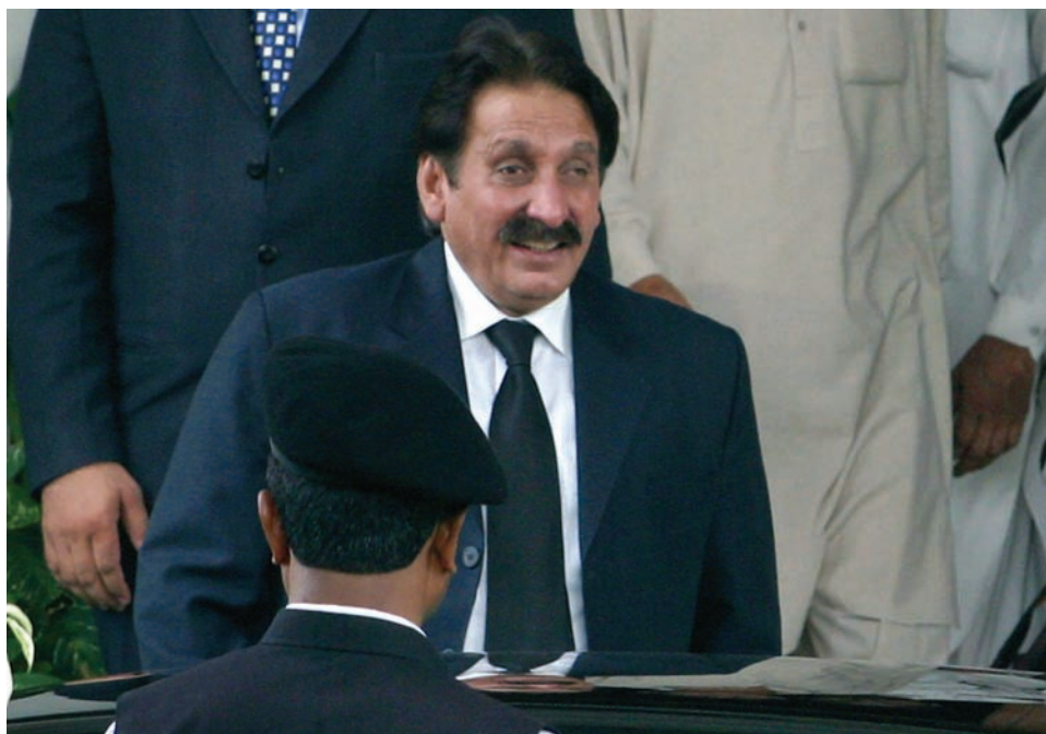
Deposed Chief Justice of Pakistan Iftikhar Mohammed Chaudhry.

Justice Rana Bhagwandas, who is under house arrest in the Judge's Colony, explained to Human Rights Watch that while he and the other judges detained there are allowed to walk within the compound of the colony, neither Chief Justice Chaudhry nor his family are allowed to even step out of their residence which is guarded by police and military intelligence personnel around the clock.