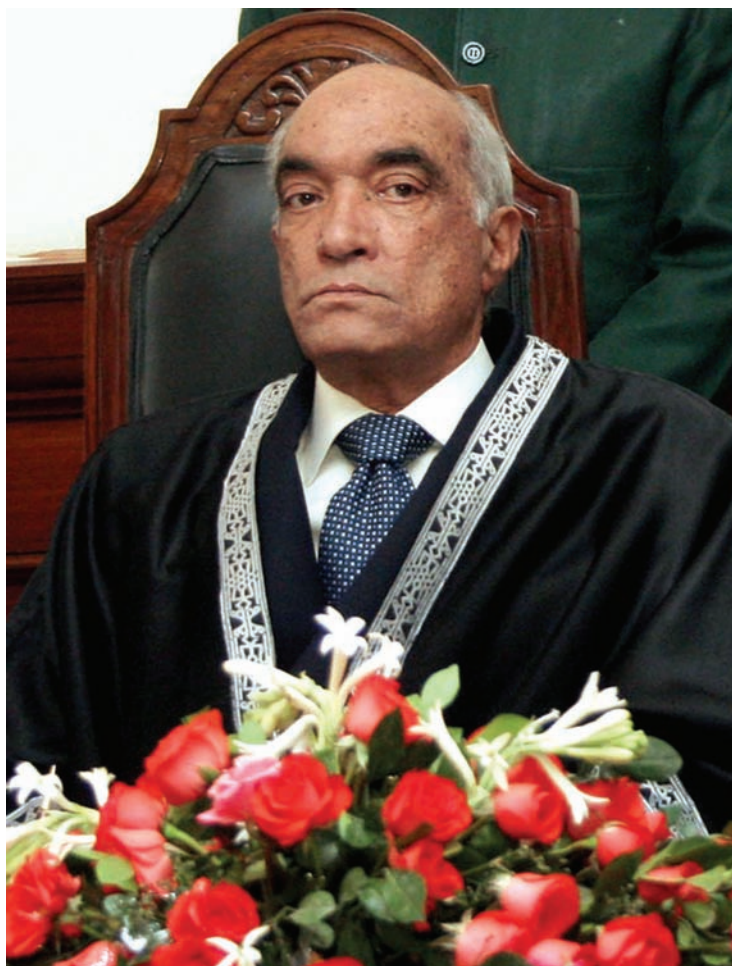
Khalilur Rehman Ramday, deposed Supreme Court judge.