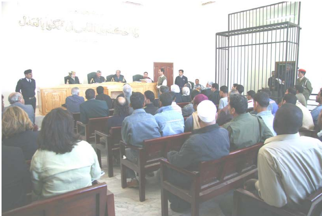
In January 2005, the General People's Congress abolished Libya's extraordinary court, the People's Court, which had heard most political and security cases and was notorious for politically motivated judgments and biased trials. Cases under the court's review at the time of its closure were transferred to regular criminal courts, like this Court of Appeals in Benghazi.

“We couldn’t even see the file in cases before the People’s Court,” one lawyer told Human Rights Watch. “The law didn’t ban us, but it was the procedures of the authorities, which were arbitrary and depended on their mood.” 34