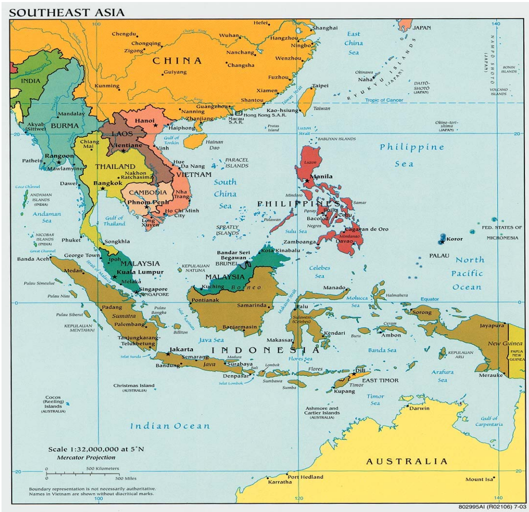
Map 1: Map of Southeast Asia