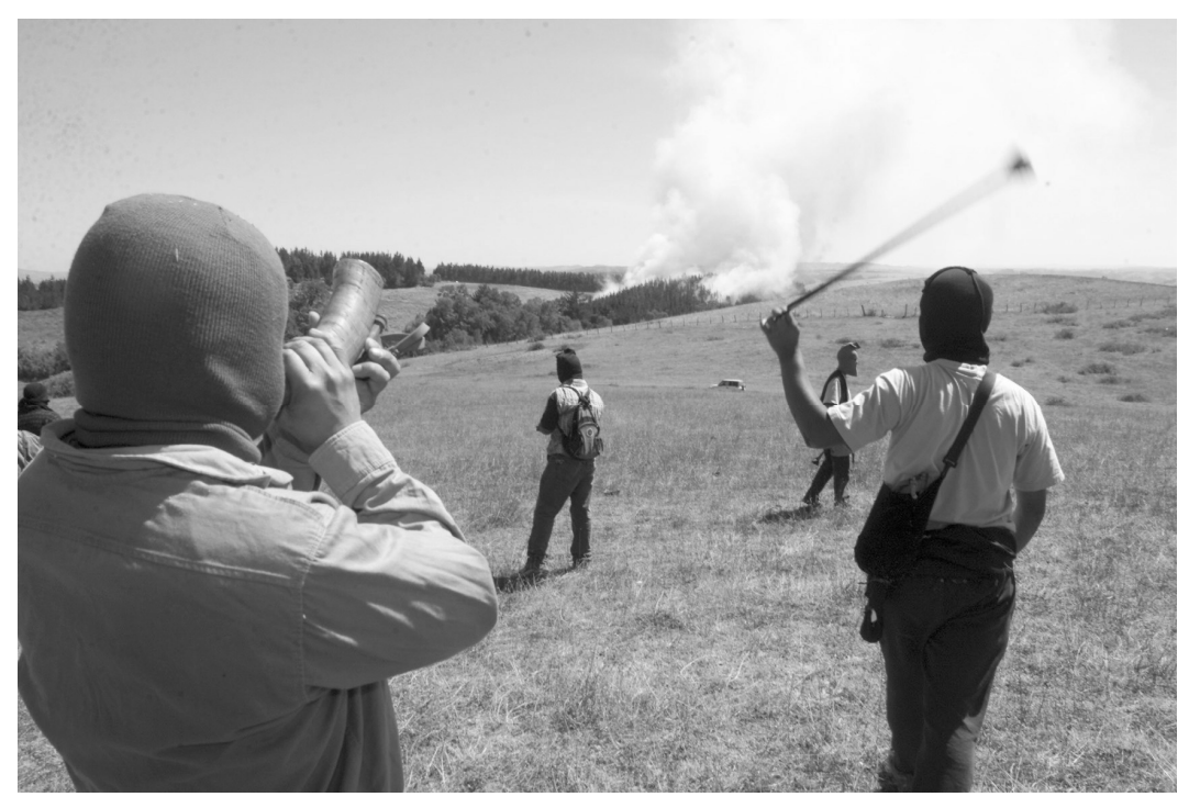
Mapuche confronting police with wetruves (boleadoras) in the fundo El Carmen of forestry company Arauco, Temuco. February 13, 2001.

Although the international community has not agreed on a precise definition of terrorism, it is widely understood that the term applies only to the gravest crimes of political violence. This is conveyed eloquently, for example, in the working definition that terrorism expert A.P. Schmid gave to the United Nations Crime Branch in 1992: "[t]errorism is the peacetime equivalent of a war crime." In the popular mind terrorism evokes images of innocent civilian hostages held captive in besieged buildings, suicide bomb attacks, and plane hijackings, not to mention the indiscriminate slaughter and destruction of the September 11, 2001, attacks. Chile's use of the anti-terrorism law for crimes committed by Mapuche in the context of land conflicts, which do not approach this threshold of seriousness, is not only inappropriate but also reinforces existing prejudices against the Mapuche people.