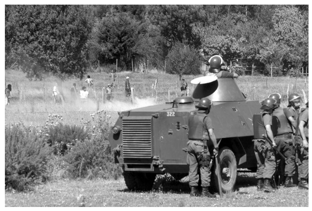
A carabineros (uniformed police) tank in the community of Temucuicui, Province of Malleco. December 2001.

In the late 1990s the press reported that some of the leftist revolutionary groups that had led the armed resistance to the military government had gained entry to Mapuche organizations and were now orchestrating the illegal actions. In coverage of the land conflicts in leading newspapers and journals, writers continue to emphasize the "infiltration" of Mapuche communities, reinforcing a view of the Mapuche as subversives and terrorists.<sup>14</sup> Whatever the historical merits of such claims, nearly all of the scores of people now facing criminal prosecution are Mapuche from the communities directly affected by the conflicts.