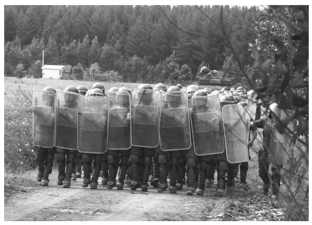
Carabineros (uniformed police) in the community of Temucuicui, Province of Malleco. December 2001.

Scores of Mapuche faced prosecution during the Frei government on charges like arson, theft, land grabbing, kidnapping, or wounding. In addition, public officials opened three separate proceedings under the Law of State Security (LSE).<sup>15</sup> Proceedings under this law are intended to be faster than ordinary criminal prosecutions. The minister of the interior or an intendente (regional local government official) initiates the prosecution, and an appeals court judge conducts the investigation and trial under special rules that apply to military courts in peacetime. These rules set fixed time limits for each stage of the trial, give judges greater discretion in evaluating evidence, and limit rights of appeal. Instead of using the LSE, the Lagos government has opted to prosecute those it sees as the ringleaders of the violent actions on terrorist charges.