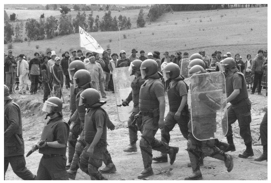
Mapuche demonstration in the community of Juan Maril de Puren. Demonstrators are demanding the withdrawal of police forces stationed in the fundo El Rincón, owned by the forestry company Mininco. November 13, 2001.

by many Mapuche organizations.<sup>19</sup> The CAM was set up at a second meeting held in 1998 in Tranakepe, Tirúa. Formed from communities defending or asserting land claims, the group undertook to support all communities in the region involved in conflicts over land and offered to incorporate them into the organization if they and their leaders approved.<sup>20</sup>