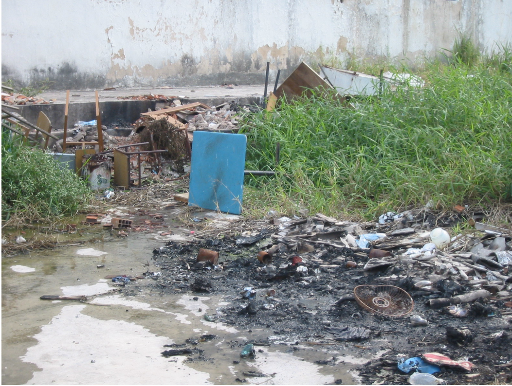
Trash, standing water, and weeds cover a basketball court in Santo Expedito.