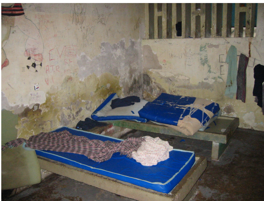
A dormitory in CAI-Baixada.

The violence against juvenile delinquents in Rio's detention centers has created a new phenomenon: In the last five months, the state public defender's office has found eighteen adolescents who preferred to complete their punishment among adults in police stations or prisons rather than submit to socio-educational measures in state [juvenile detention] facilities. That is, each month at least three youths pretend to be adults when they are taken prisoner by the police. Discovered by public defenders or by nongovernmental organizations, they say that it is better to be in the state prison system—implicated in recent months by denunciations of torture, death, and corruption—than to be detained in Department of Socio-Educational Action (DEGASE) institutions. 163