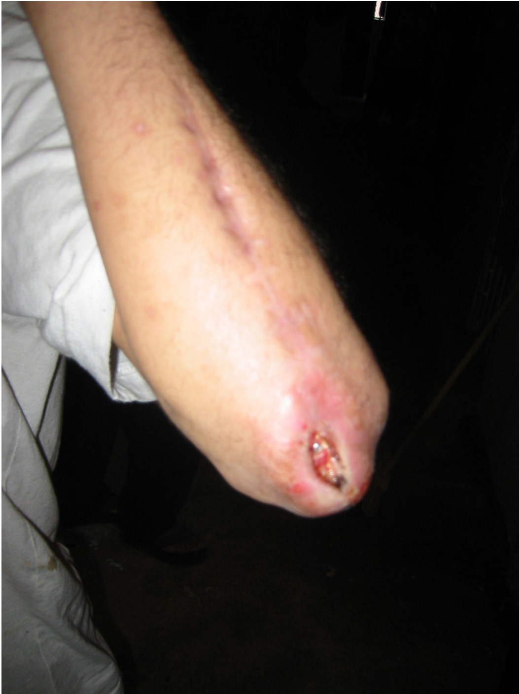
A youth in Santo Expedito shows an open wound.