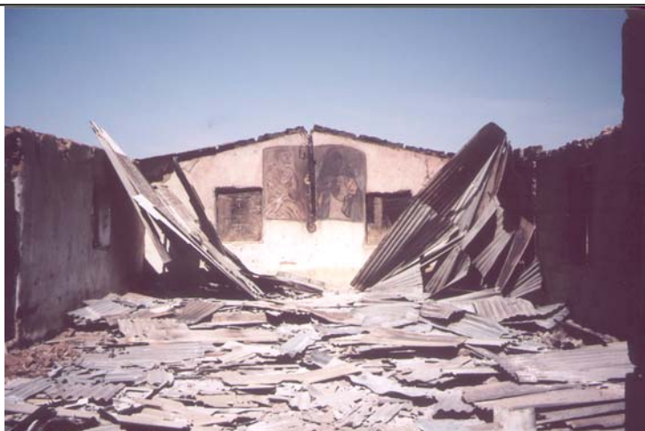
Christ Apostolic Church in Nariya, destroyed in November 2002.

"I saw a soldier shoot a man dead in front of me, on Saturday morning. The soldier had two stripes on his uniform. He was from the army. Soldiers were chasing people. A man was trying to enter his house. They shot him outside the house. [...] I could see he was not holding any weapon. The soldier aimed at him directly. He shot him in the chest from the front. It was on Nasarawa road, after the market. He died on the spot. Then the soldier just walked away."