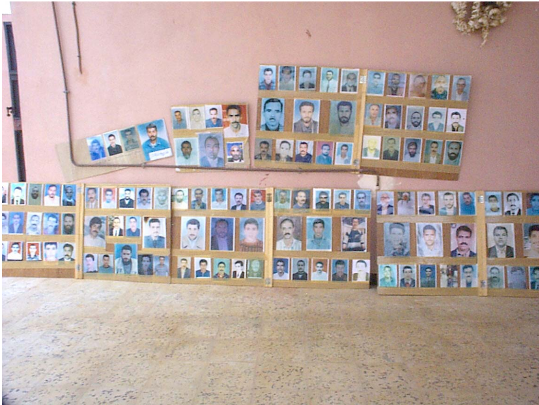
Photos of the “disappeared” in Algeria.