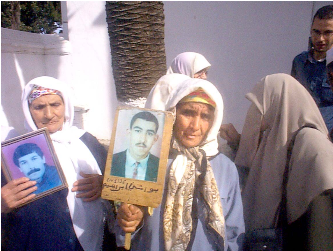
Relatives of the “disappeared” stage their weekly sit-in outside the headquarters of Algeria’s Human Rights Commission in Algiers, October 30, 2002.