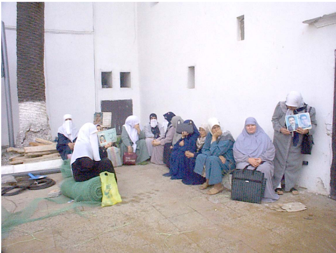
Relatives of the “disappeared” stage their weekly sit-in outside the headquarters of Algeria’s Human Rights Commission in Algiers, October 30, 2002.