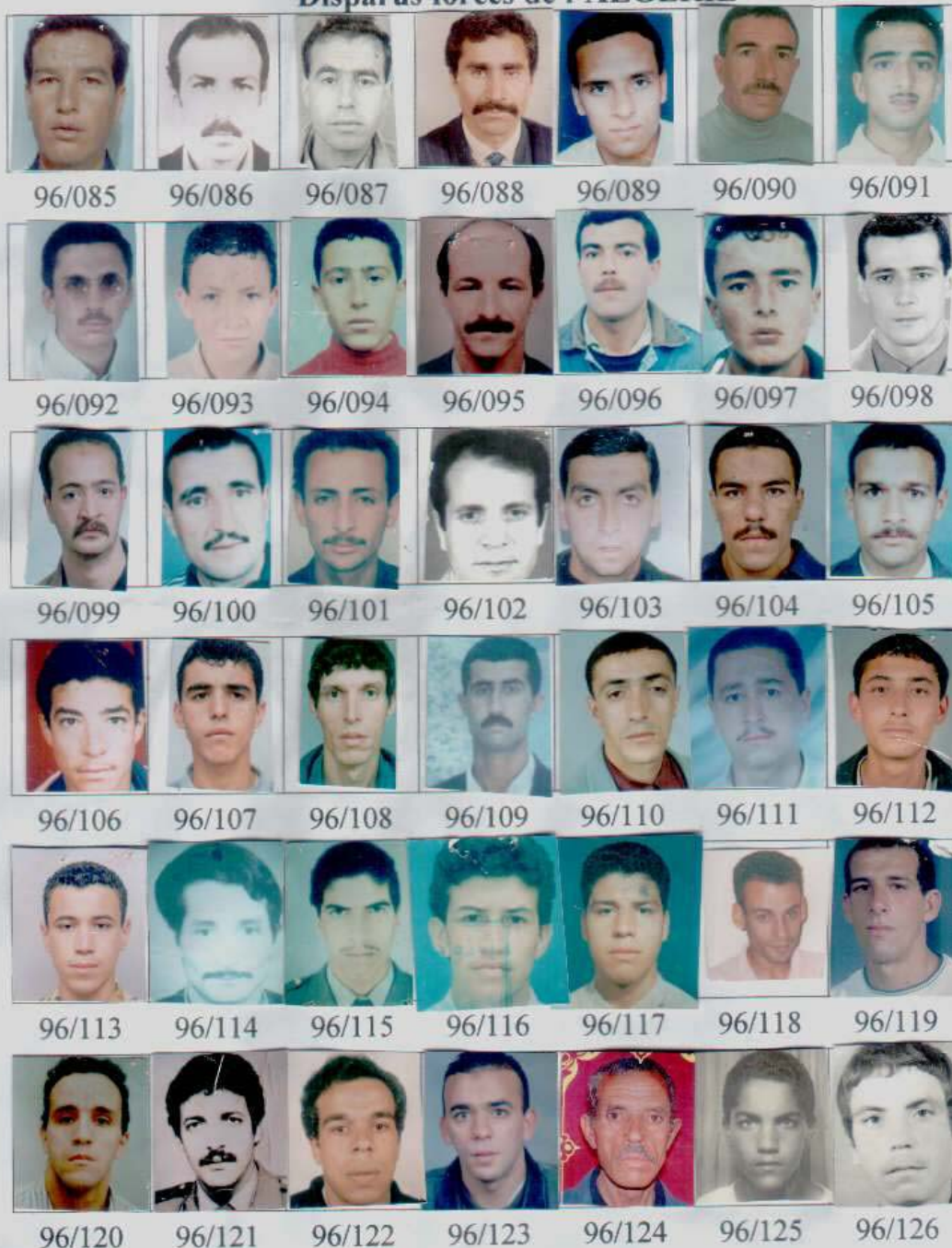
A selection of photographs of persons “disappeared” during 1996, compiled by the Association of Families of the Disappeared in Constantine.