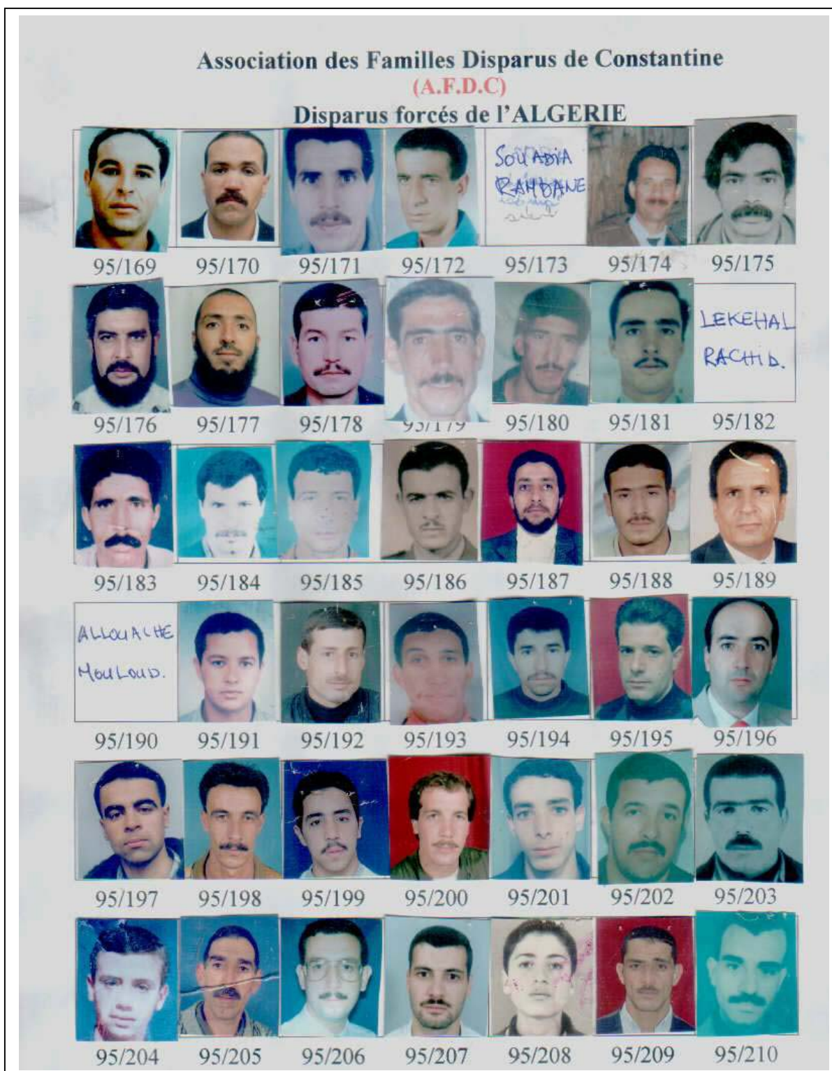
A selection of photographs of persons “disappeared” during 1995, compiled by the Association of Families of the Disappeared in Constantine.