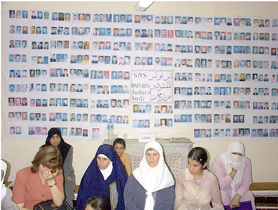
Relatives of the “disappeared” at the Algiers headquarters of the organization SOS Disparu.