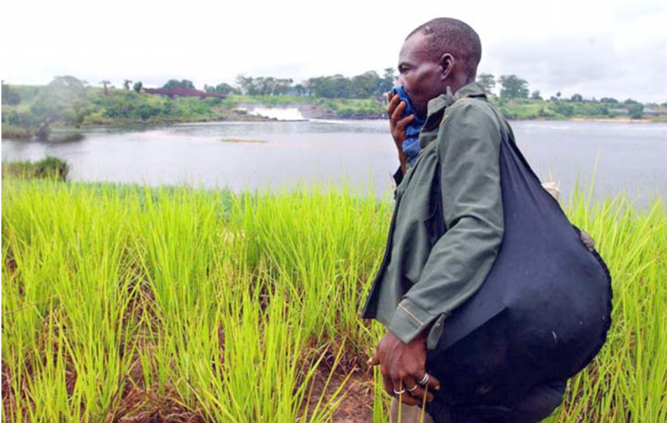
A Congolese man from Kisangani covers his mouth as he nears the Tshopo bridge, the scene of summary executions by RCD-Goma troops following an attempted mutiny.

I counted thirty bodies and bags between the dam and the small rapids, and twelve beyond the rapids. Most corpses were in underwear, and many were beheaded. On the bridges there were still many traces of blood despite attempts to cover them with sand, and on the small maize field to the left of the landing the odors were unbearable.