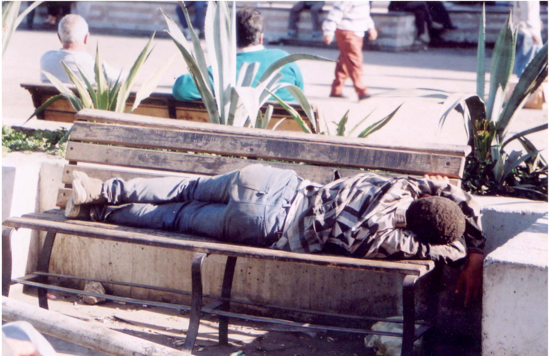
A boy sleeping on a park bench in Ramsis Square in downtown Cairo.