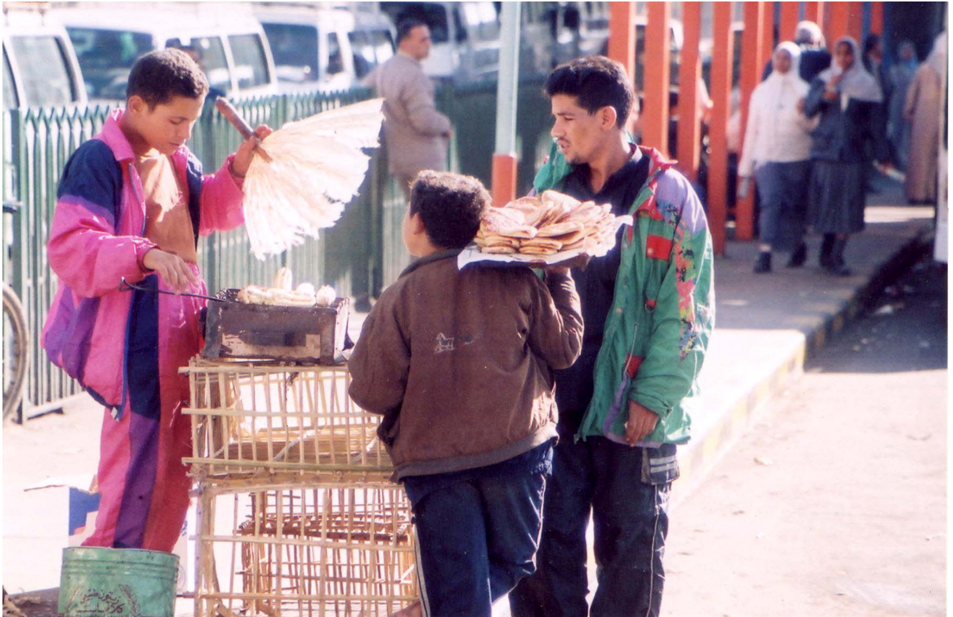
Boys selling roasted corn and bread in downtown Cairo.