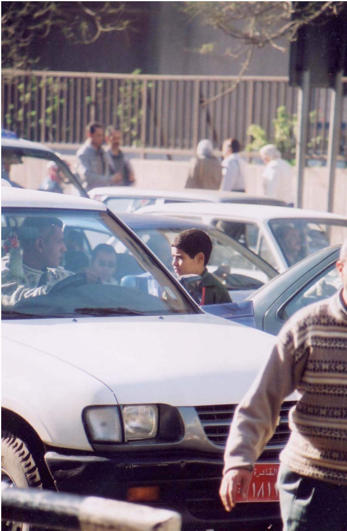
A young boy selling tissues to drivers stopped in traffic in Ramsis Square in downtown Cairo.