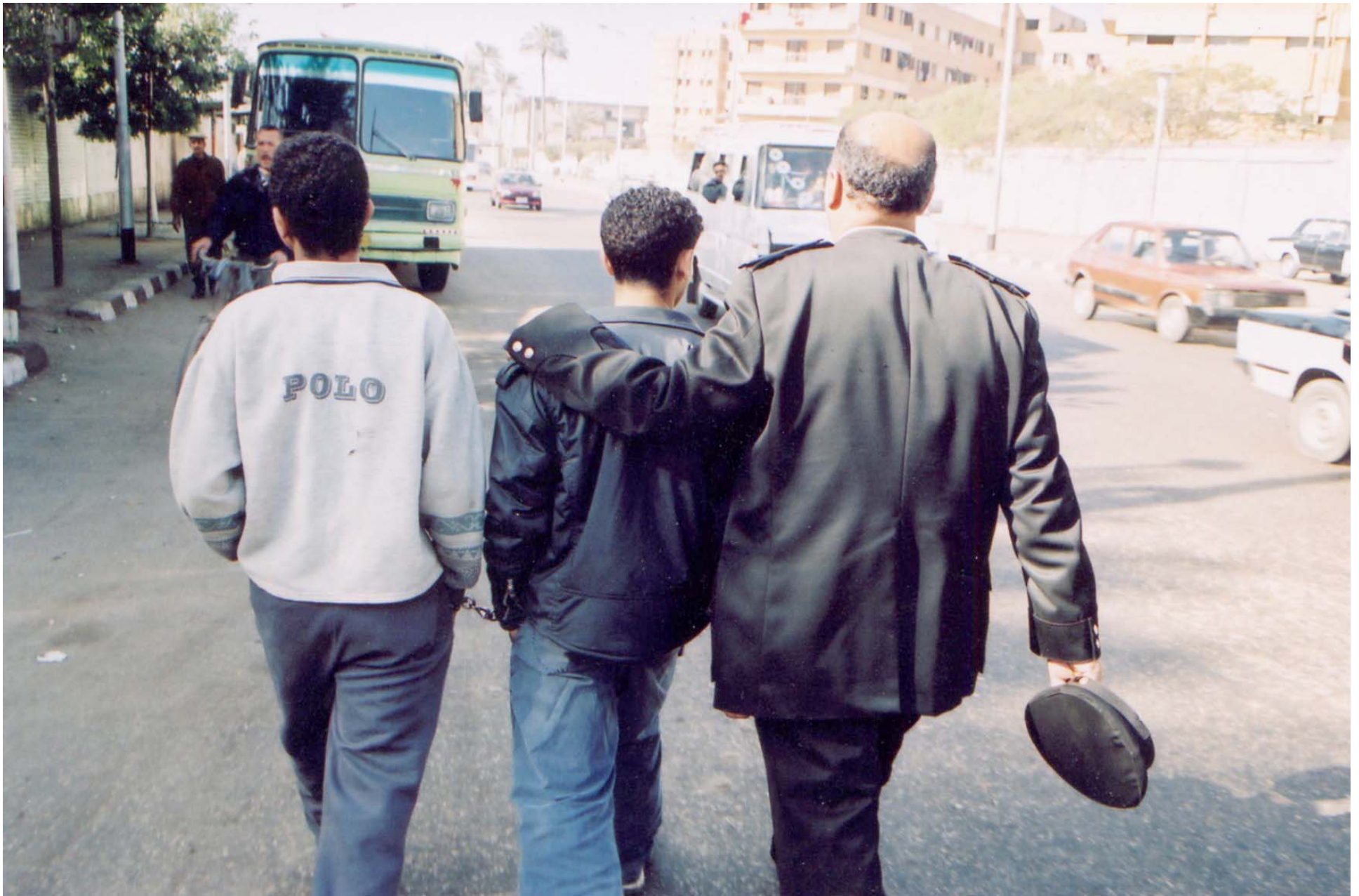
A low-ranking policeman marching two boys in handcuffs on a public street after having taken them to the Cairo Juvenile Court building only to find out that there were no court sessions that day.