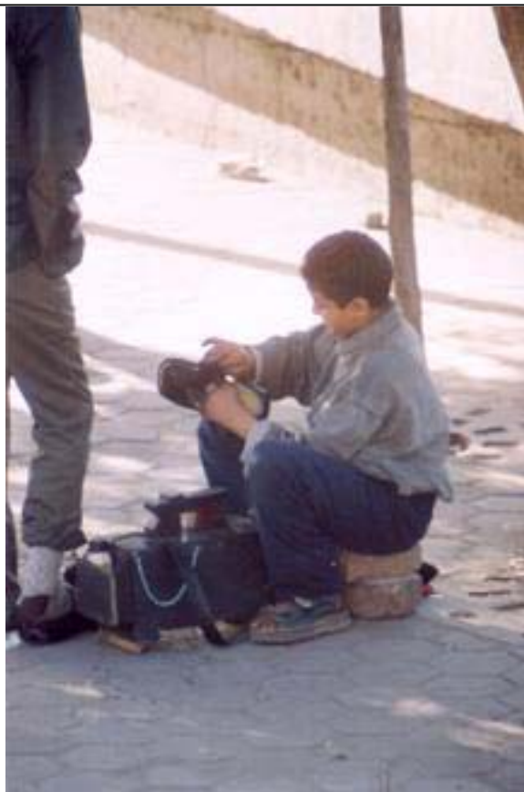
A young boy shining shoes near the al Azbekiya police station in downtown Cairo. Egyptian police consider children who offer “services of little value” to be begging and can arrest them for being “vulnerable to delinquency.”

We arrest kids in parks who look like they are homeless. We arrest kids selling tissues in the street. These kids become known to us, so it isn't hard. [Sometimes] we arrest kids walking down the street during school hours with their school books, but I don't have enough officers to make as many of these arrests as I would like. I am asking for more officers, because in the future we want to conduct campaigns to search for and arrest truants.”