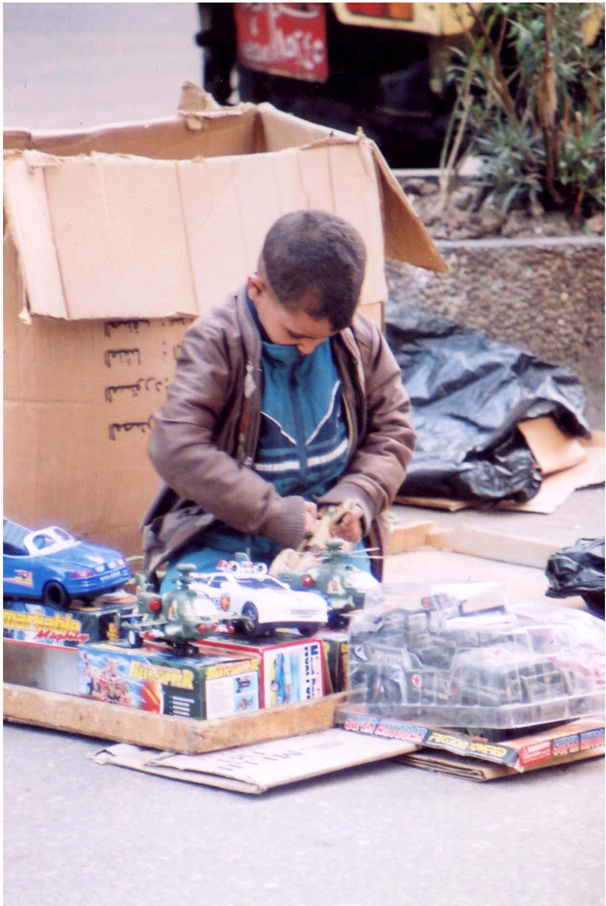
A young boy selling toys on one of Cairo's major downtown streets.