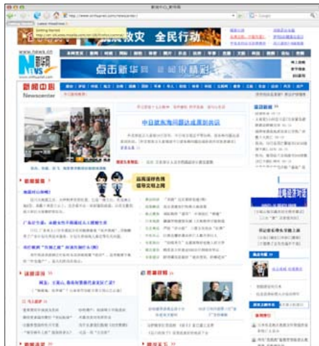
The website of state-run newswire Xinhua features animated “cybercops.”