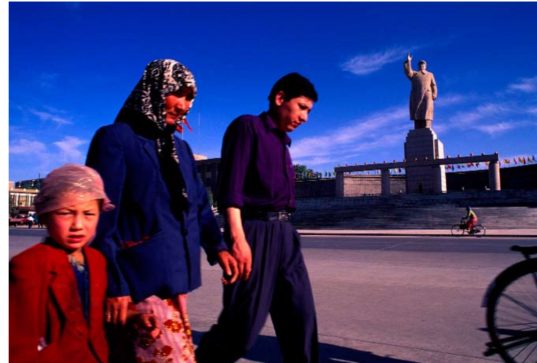
A family of ethnic Uighurs walk past a concrete statue of Chairman Mao in Kashgar, Autonomous Region of Xinjiang.

The freedoms granted to foreign journalists in the new regulations do not extend to local sources and staff of foreign journalists, Chinese assistants, translators, “fixers,” and researchers. These persons are increasingly the target of intimidation by government officials, security forces, and plainclothes officials when foreign correspondents put up a fight over their reporting rights. The local source of a foreign journalist covering a story on pollution in western China in February was later hounded by police, who warned him that he would face charges of “subversion” if he spoke to foreign journalists again. Meanwhile, the assistant of a Beijing-based foreign correspondent who has extensively covered Chinese dissidents has come under the intensive scrutiny of two security agencies whose intimidation tactics have included harassment of the assistant’s parents and former school teachers.