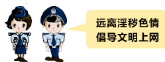
China's animated “cybercops” warn web users to engage only in “harmonious browsing”.

If at any time during your stay in China you feel that your reporting rights are not being respected, we encourage you to immediately inform the International Olympic Committee, your own National Olympic Committee and the Beijing Organizing Committee for the Olympic Games (BOCOG). Contact information is available at the end of this guide.