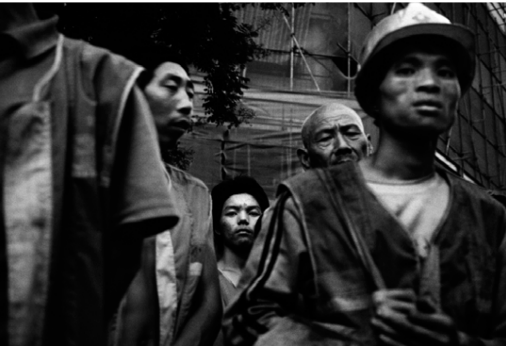
Above: Migrant workers wait for buses to transport them to construction sites.