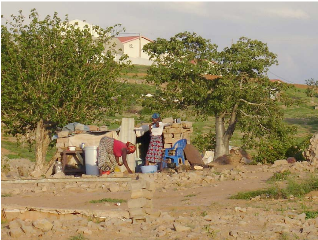
Evictees at the Cambamba I eviction site.

They arrived and didn't talk to anyone...and they pushed down the houses...There was time for nothing...we couldn't take anything out. They broke my bed, my oven; they ran over everything. I tried to do something and they took me. I was trying to get my stuff out and they threw me in the police car...I had a brick house. 72