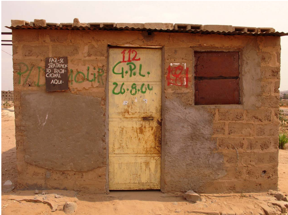
House marked for demolition by the Provincial Government in Mbondo Chape.

Evictees from Benfica told Human Rights Watch that only those individuals who were home on the day of the numbering had their houses marked. All those who were not present had their houses ignored. Later when they were evicted and their houses demolished, only those who had their houses marked were relocated.