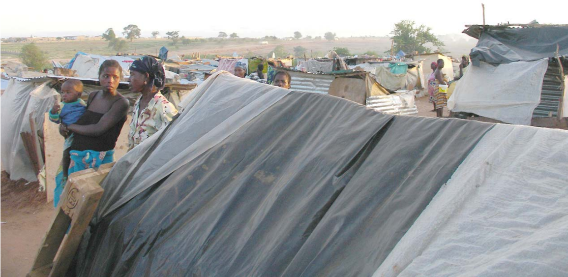
Evictees from Cambamba II living in shacks after a series of eviction operations that demolished their original homes.

The provincial government gave empty land plots in relocation areas to some evictees from Onga. These evictees affirmed they did not receive any construction material to build new houses to replace the demolished ones, or for the construction of emergency shelter. They lived for months in shacks while saving money to build: