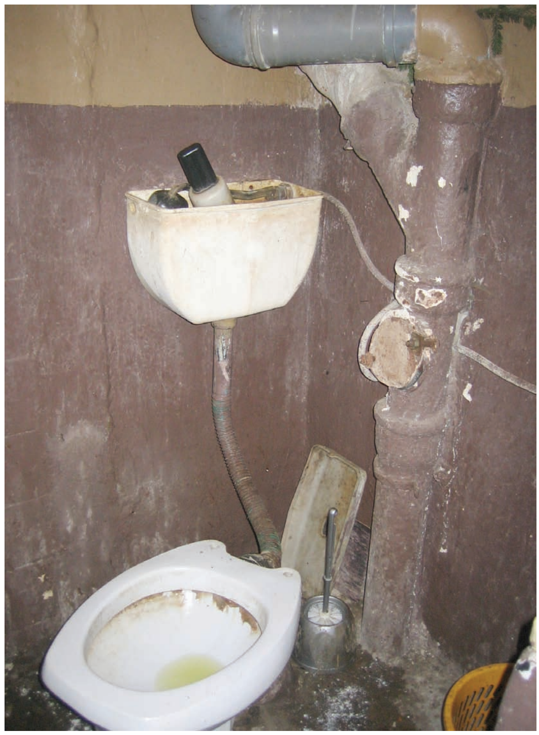
The four photographs above were taken on April 19, 2005 at the Mostyska Border Guard Detention Center in Ukraine and show the one toilet and "shower-room" for male and female detainees.