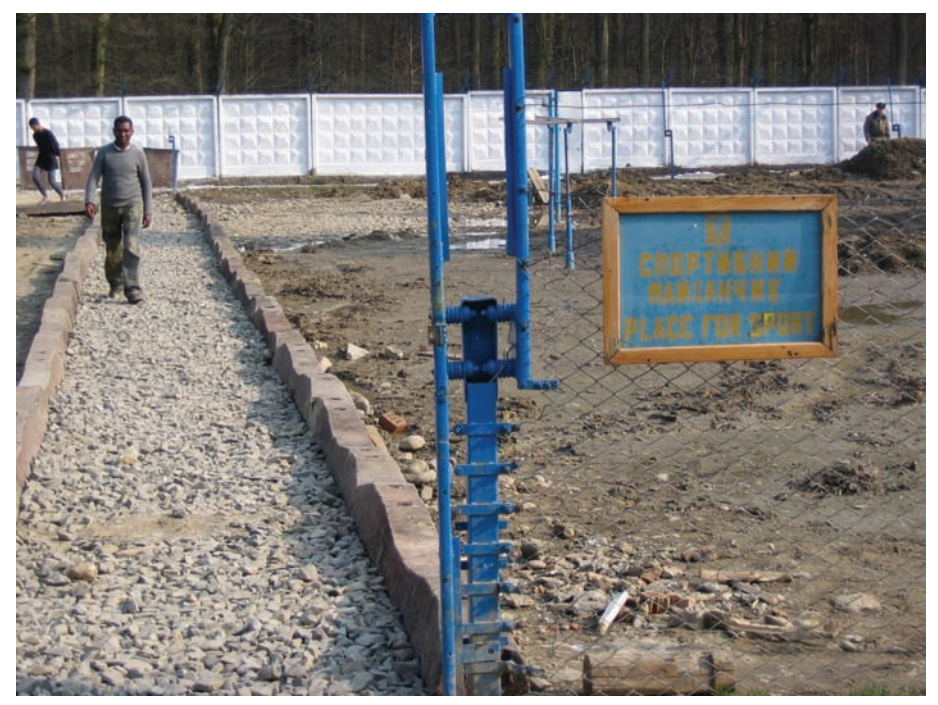
This photograph taken on March 28, 2005 shows the yard at the Pavshino Center for Men where detainees are permitted to play soccer or get fresh air.

Limited Access to Fresh Air, Natural Light, and Exercise