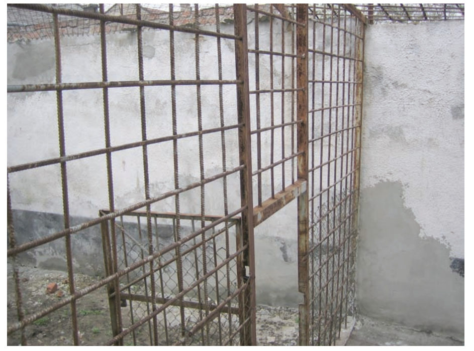
This photograph taken on April 18, 2005 shows the yard at Lviv vagabonds' detention center. The space shown here is where detainees are allegedly allowed to exercise.