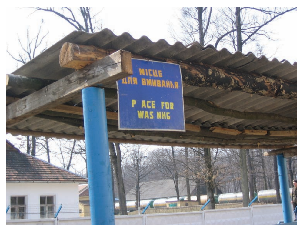
This photograph, taken on March 28, 2005, shows washing facilities at the Pavshino Center for Men, located near the Ukrainian Border with Slovakia and Hungary.

In every facility visited by Human Rights Watch, toilet facilities were unhygienic, and access to bathing facilities was limited. Detainees told Human Rights Watch that they were expected to clean the cells and toilets themselves, and were not provided with cleaning materials.