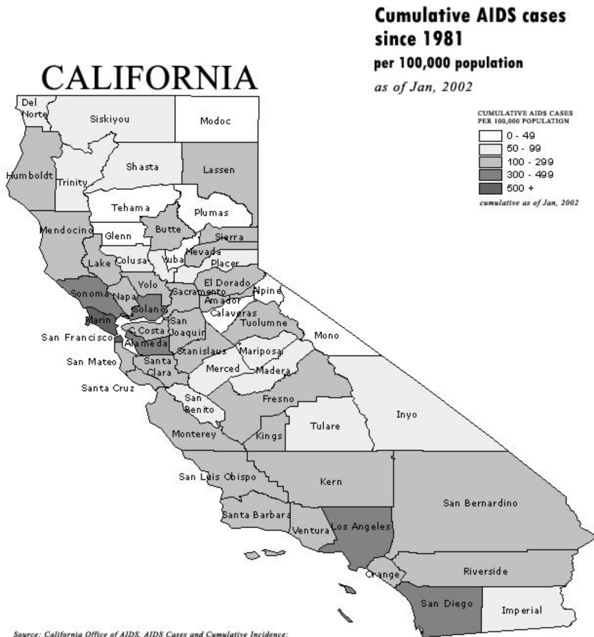
MAP 1: CUMULATIVE AIDS CASES IN CALIFORNIA SINCE 1981