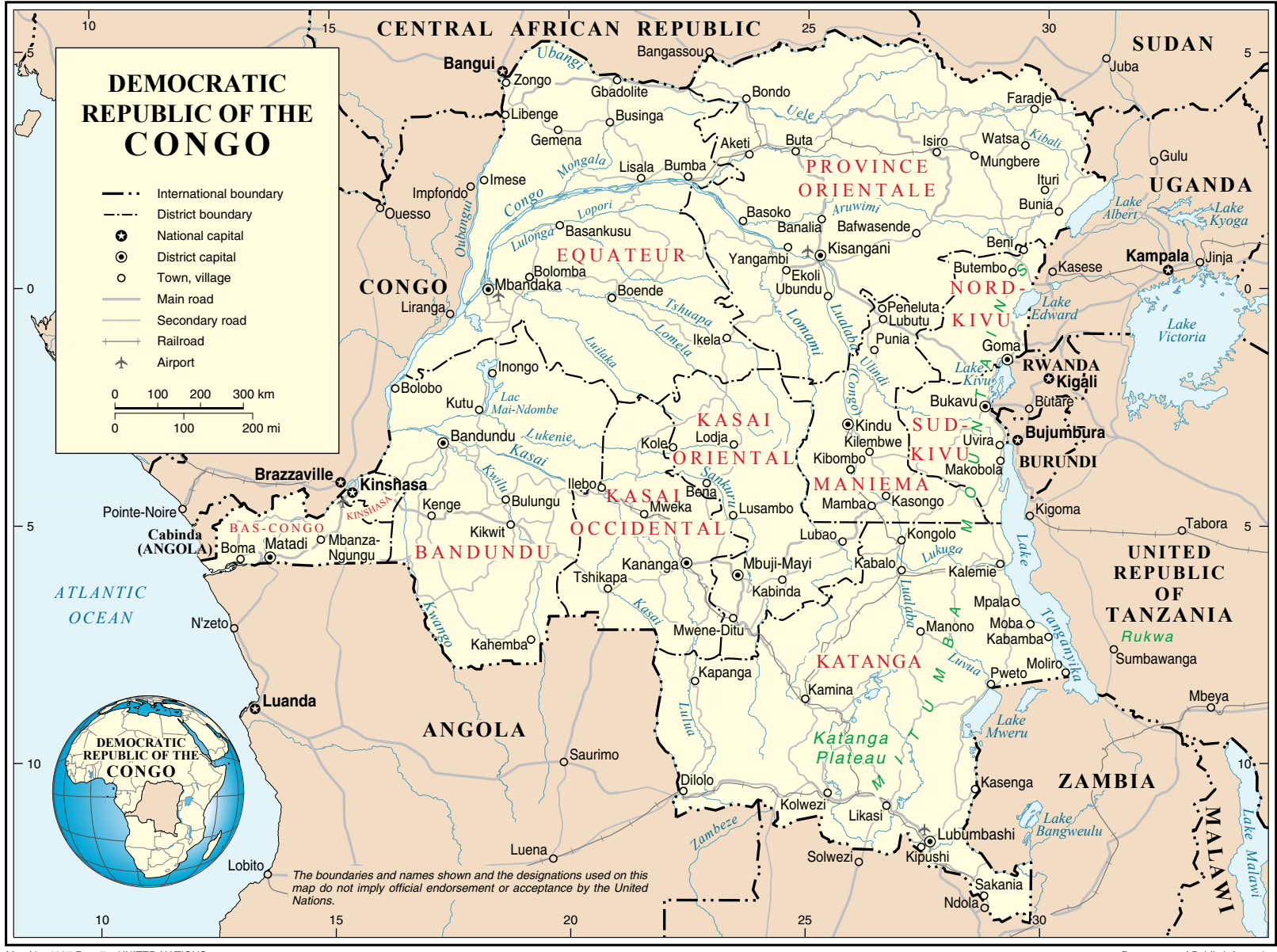
Map No. 4007 Rev. 7 UNITED NATIONS March 2002