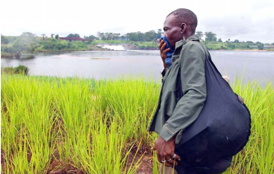
A Congolese man from Kisangani covers his mouth as he nears the Tshopo bridge, the scene of summary executions by RCD-Goma troops following an attempted mutiny.

I counted thirty bodies and bags between the dam and the small rapids, and twelve beyond the rapids. Most corpses were in underwear, and many were beheaded. On the bridges there were still many traces of blood despite attempts to cover them with sand, and on the small maize field to the left of the landing the odors were unbearable.